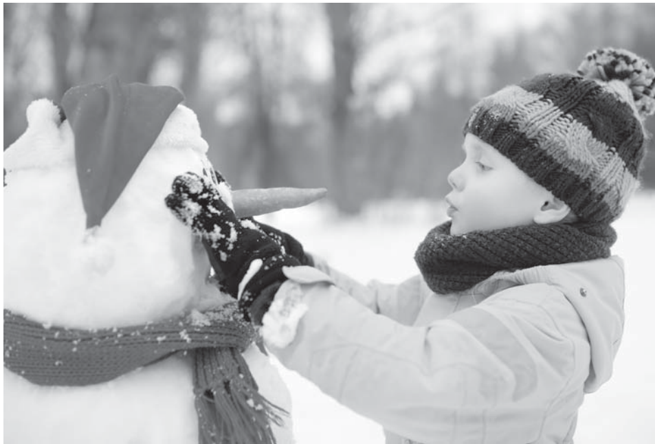
Oh, the joy of building a snow man - now we just need some snow!

The holiday season is in full swing and Pittsburgh has pulled out all of the stops, as usual!