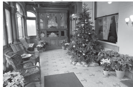
A beautiful room at Clayton.

The Clayton Holiday Tours will be given throughout December. The Frick Family home will be beautifully decorated for the holidays as it was in the Gilded Age. Info at thefrickpittsburgh.org .