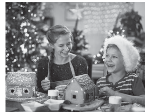
Making gingerbread houses

to help you make a gingerbread house. Build a snowman or woman!