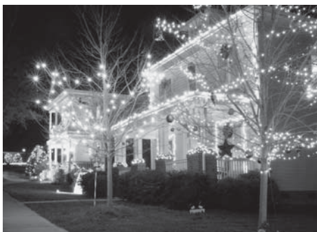
Neighborhood lights are great!

Christmas light displays are everywhere. You can just opt to drive around the neighborhoods and find