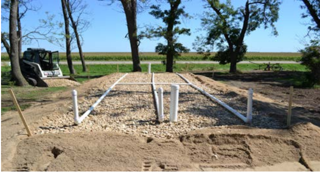
Subsurface Sewage Treatment System

Site inspections were completed for verification of soil and system installation certification for 49 Septic systems. The office distributed approximately $120,000 of county low interest loan dollars for 13 system updates.