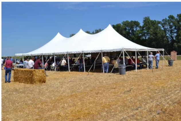
Rock River Manure Expo Field Day

A Clean Water Legacy grant was received by the Rock County SWCD to clean up impaired waters within the Rock River. The Pipestone SWCD held a manure management field day in conjunction with the Rock SWCD to educate livestock producers and commercial manure applicators about proper manure handling to prevent pollution within the Rock River