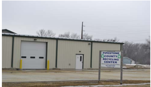
The Pipestone County Recycling Center

After 10 years of planning construction began mid 2012 and was completed just before the end of 2012 on the new Pipestone County Household Hazardous Waste and Recycling Facility. This is a less than 90 day HHW facility, allowing us to collect HHW throughout the year along with Electronics, Appliances, Fluorescent lights / ballasts, Lead Acid Batteries, & Empty pesticide containers. In 2012 Pipestone County collected and recycled 6.88 tons of electronics, 2.17 tons of florescent bulbs, 1.56 tons of ballasts, and 39 tons of major household appliances. We also held 2 household hazardous waste (HHW) collections this year and collected 1.7 tons of hazardous material and 3.3tons of paint. A new radio contact was also purchased to allow us to run daily PSA's on the promotion of recycling and waste reduction.