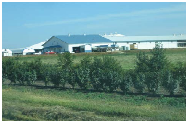
Established tree planting

This year there were a total of approximately 10,000 trees sold. Trees were utilized for field windbreaks, farmstead / feedlot windbreaks, and wildlife habitat planting. District staff also sold and installed approximately 36,000 feet of tree fabric.