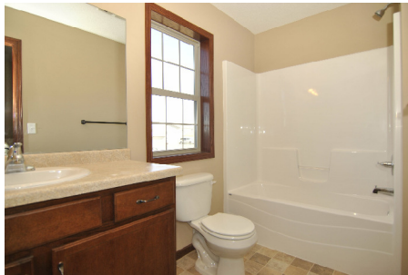
SOME OPTIONS MAY BE SHOWN