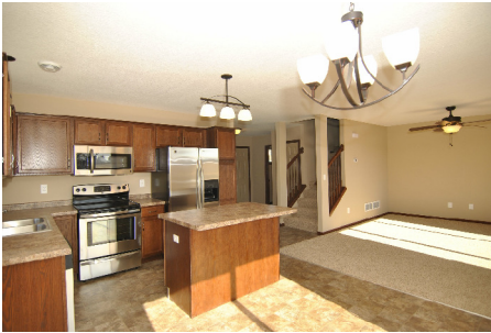
PHOTOS OF PREVIOUSLY FINISHED HOME