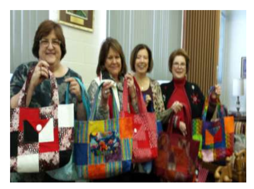
Beautiful totes & joyful volunteers