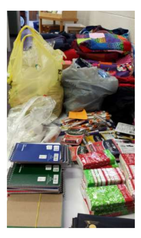
Some of the Women's items