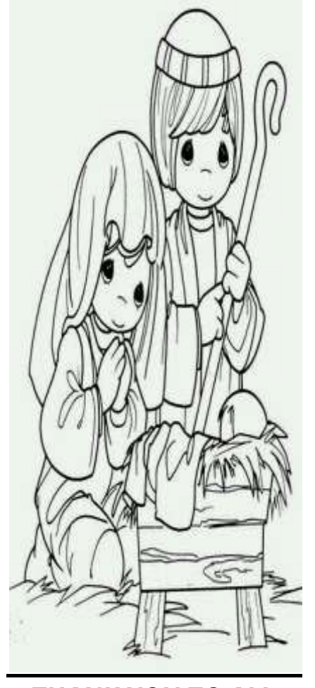
THANK YOU TO ALL INVOLVED IN THE CHRISTMAS PLAY!!

We hope to see everyone back on January 7, 2018