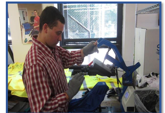
Fostering Independence & Work Skills