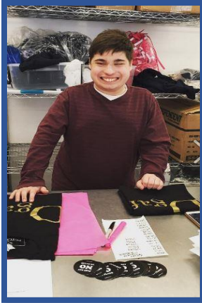
Exploration & Hands on Experiences