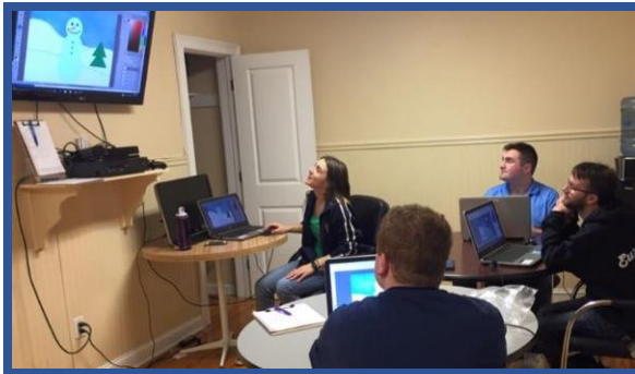
Promoting skills that foster meaningful relationships and fulfilling lives.

In addition to the services The Nicholas Center offers throughout the 10 month school calendar, it also offers a 6 week summer program. Have your district contact us today!