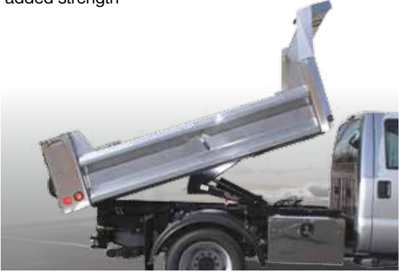
Rigid smooth sides are also available.

Seamless one-piece front design with ¼ integrated cab shield with V-bend for added strength