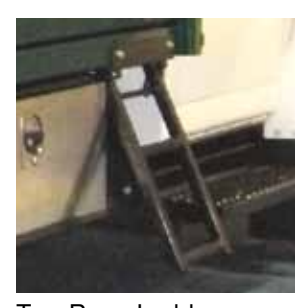
Two Rung Ladders