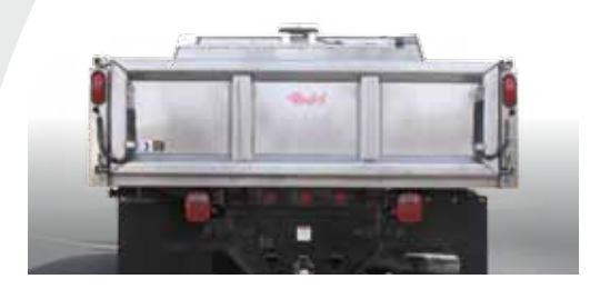
Vertical tailgate allows easy attachment of spreaders during winter.

The stainless steel Eliminator is built with a one-piece floor, dirt shedding sides, a centrally located quick release lever, (fold down side models only) the patented EZ-LATCH™ system and integrated ¼ cab protector. The unit is designed to provide years of service.