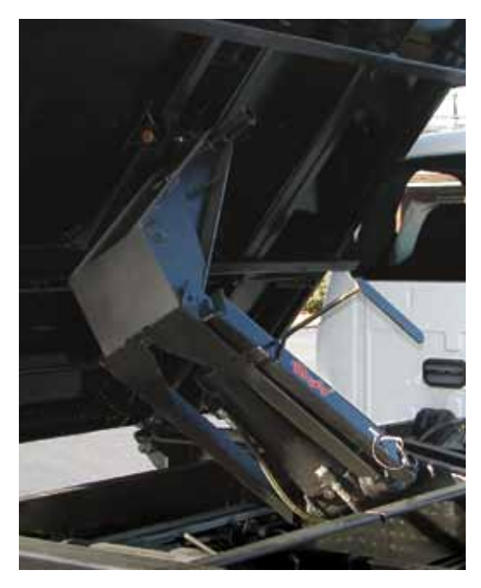
Multi-Directional dumping hoist specifically designed for MD Eliminator body.

Dumping direction is easily controlled with one lever and Rugby's standard tailgate release controls both the rear and the side release. The Eliminator-MD includes Rugby's patented EZ-LATCH™. Standard vertical side and tailgate braces along with the Eliminator's sleek design offer the complete package to make your work truck stand out!