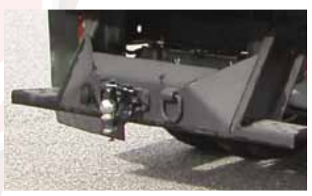
Pintle and Receiver Hitch Plates