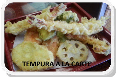
TEMPURA A LA CARTE