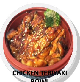
CHICKEN TERIYAKI BOWL