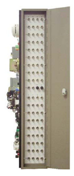
Right side view of H-ACCS-1 showing Fault Switch compartment and lockable access door