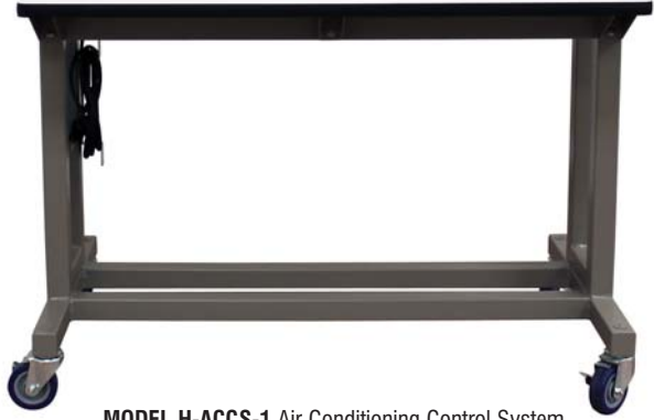
MODEL H-ACCS-1 Air Conditioning Control System Dimensions: 75"H x 48"W x 30"D Shipping Weight: 450 lbs