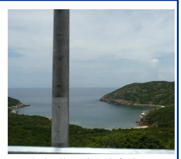
An undeveloped bay to the north of Vinh Hy Bay.

The world-famous Aman Resort Group is about to open their newest resort on the hills overlooking Vinh Hy Bay.