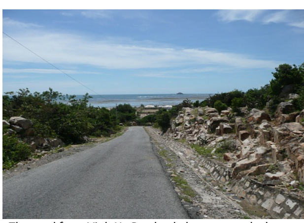
The road from Vinh Hy Bay back down towards the south (Picture from 2011, they are widening this section now).