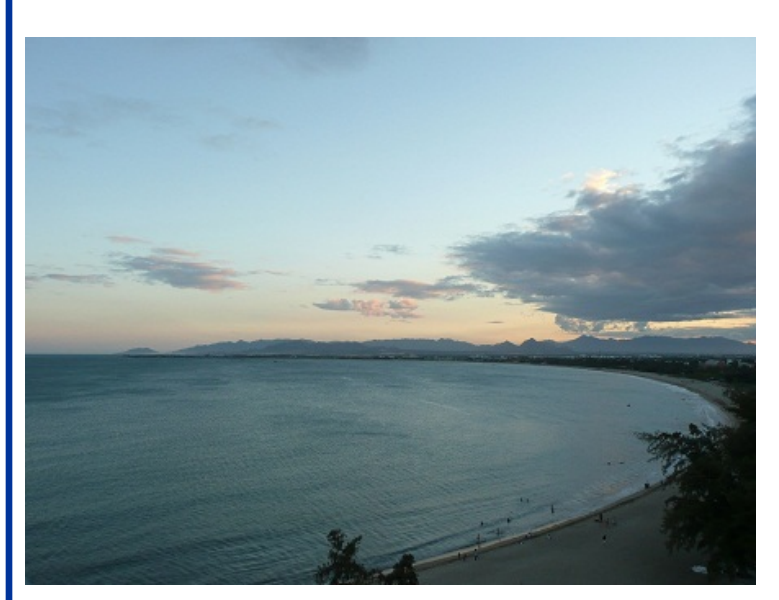
Ninh Chu Bay (taken from the top of Saigon Tourist Ninh Chu). The road is 4-lanes with a divide, and runs the length of the bay. It did not have to be upgraded. Resorts lay in between the road and the beach.

Adjacent to the capital of Phan Rang is Ninh Chu Bay, one of the nine most beautiful beaches in Vietnam. Before 1967, it was used as the private beach of the President of South Vietnam. During the war, a U.S. Airbase was built here because it was naturally protected from typhoons. Now, many Vietnameseowned resorts line the bay, including the 8-floor Saigon Tourist-Ninh Chu Hotel.