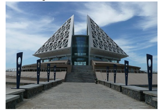
New Museum that just opened near the beach