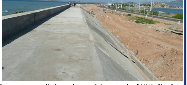
The new seawall along the road, just north of Ninh Chu Bay