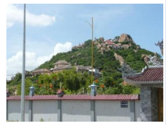
Monasteries, statues, and walking paths on the hills right above the coastal road.