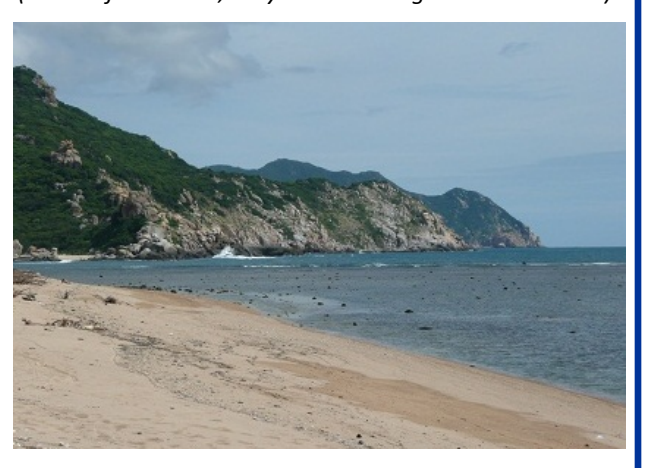
Near the coast, between Vinh Hy and Ninh Chu Bay.