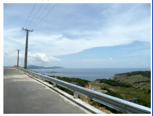
The road as it approaches the pass