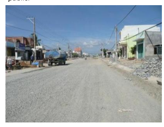
The road from the beach to Highway 1A, being widened.