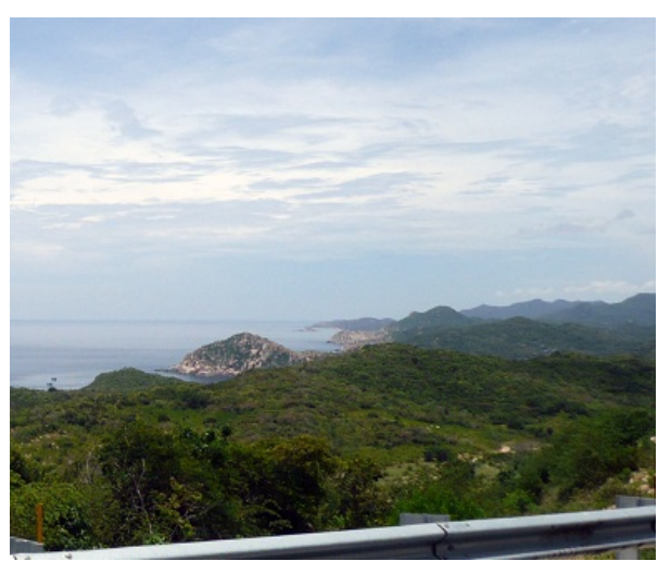
Looking south from the summit.