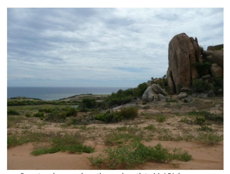
Desert and ocean along the road south to Mui Dinh.

Driving south to Mui Dinh and then Ca Na, it is startling how much the climate and geography change. In just 116 kilometers, the highway travels through rainforest, Mediterranean, and finally into an arid climate. The sand dunes around Mui Dinh are popular places for tourists to watch sunrise and sunsets.