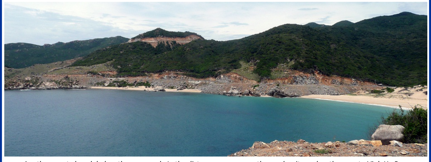
Another empty beach below the new road. In the distance you can see the road as it reaches the pass to Vinh Hy Bay.