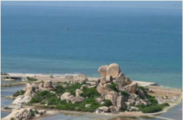
Taken from a hill above the road - A rock formation near the ocean. The road is between the rocks and the ocean.