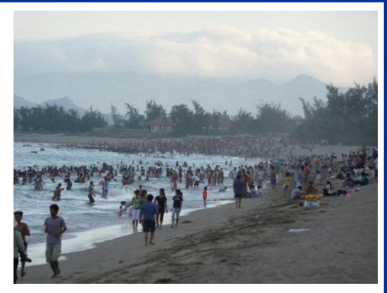
Ninh Chu Bay. Resorts along the bay have private beach rights but some sections are public.