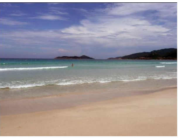
Binh Tien Beach

We believe that Silverfin has signed a MoU with the Ninh Thuan Government to develop a "Ritz-Carleton" style resort on one of the empty beaches along this stretch of road.