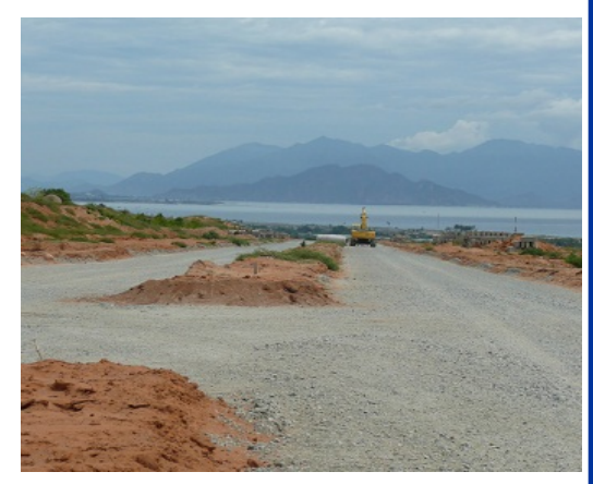
New highway south of Phan Rang. Picture taken in 2011, the road is finished now.