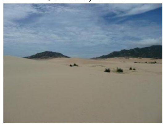
Sand dunes along the road near Mui Dinh