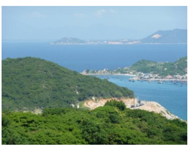
The view from the road at the summit, looking down on the new route to the north.

Looking down from the road to a secluded beach.