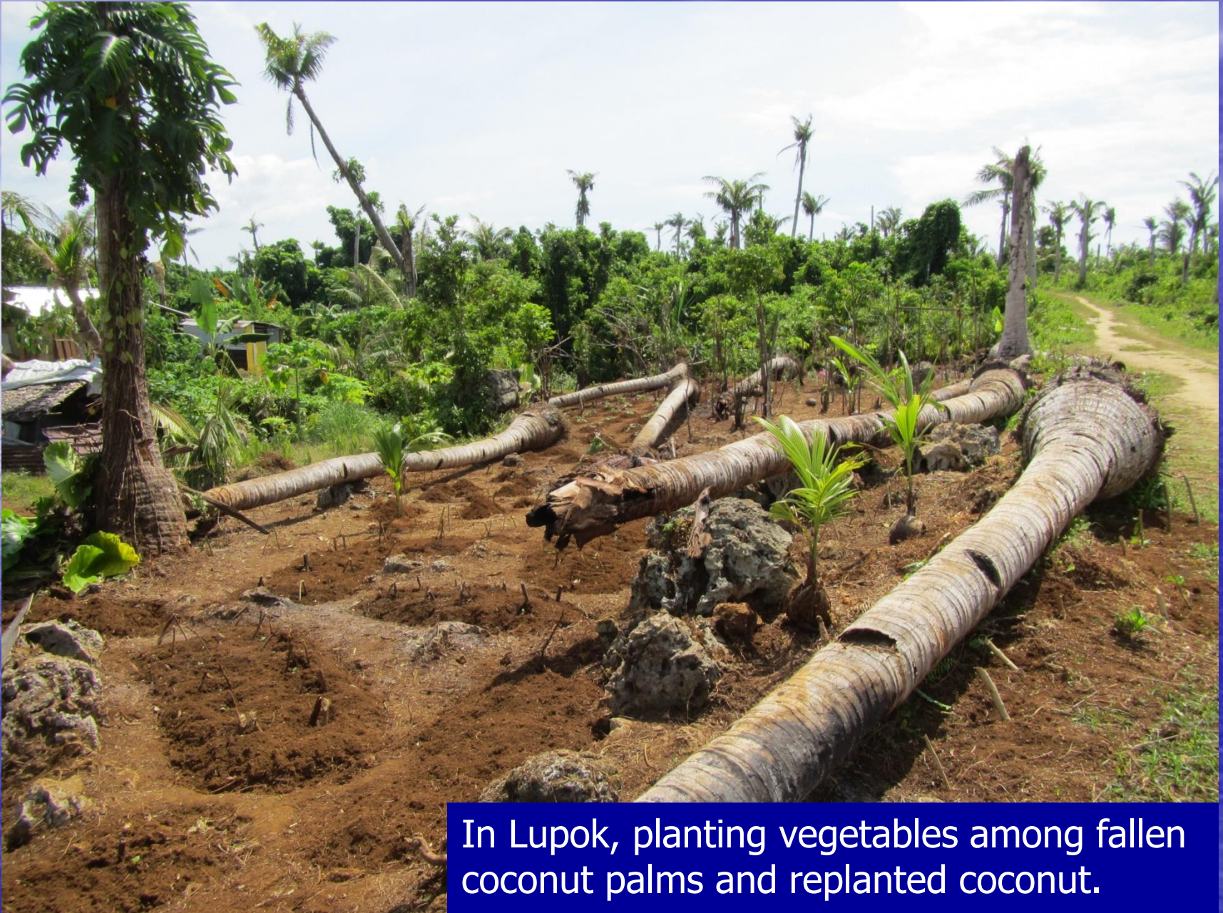
In Lupok, planting vegetables among fallen coconut palms and replanted coconut.