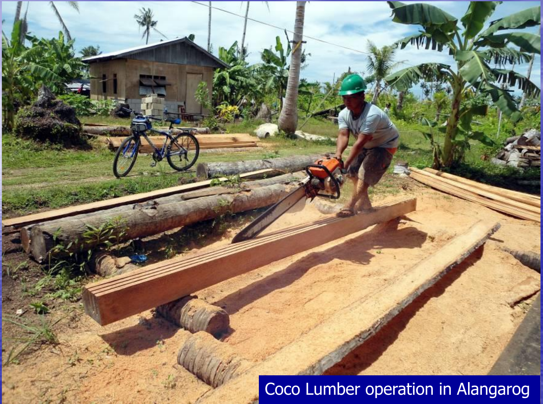
Coco Lumber operation in Alangarog