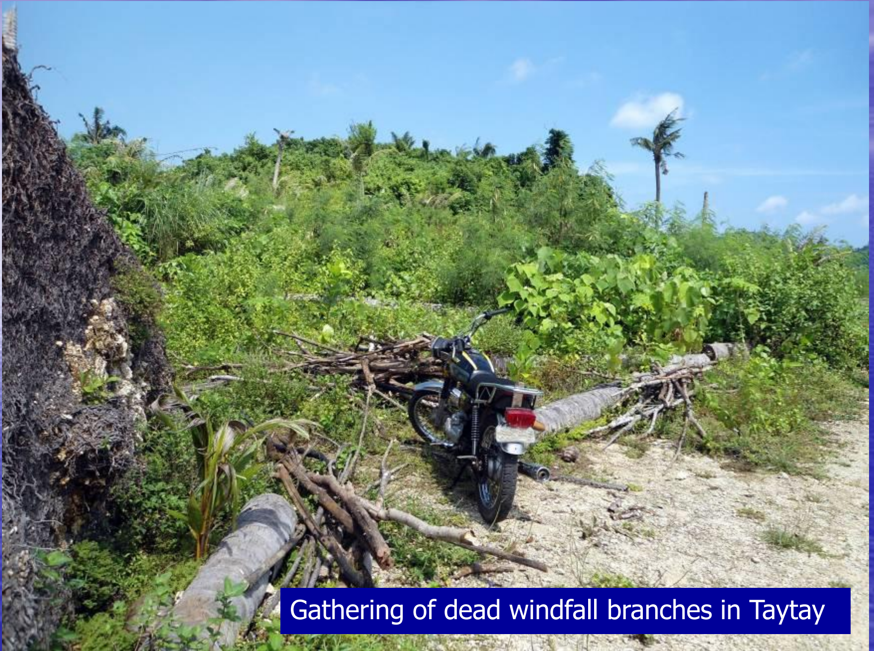
Gathering of dead windfall branches in Taytay