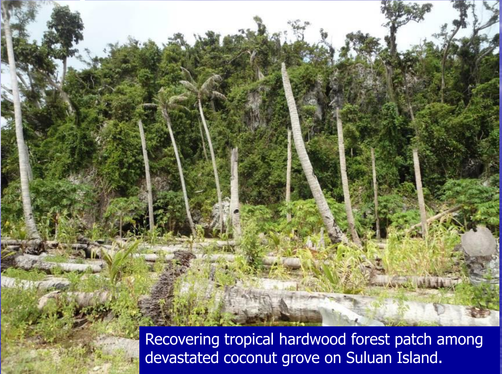
Recovering tropical hardwood forest patch among devastated coconut grove on Suluan Island.