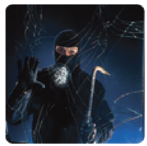
SIMPLE - EFFICIENT - EFFECTIVE

- A simple solution for securing/locking sliding windows is to cut a dowel to fit in the sliding track alongside the frame.