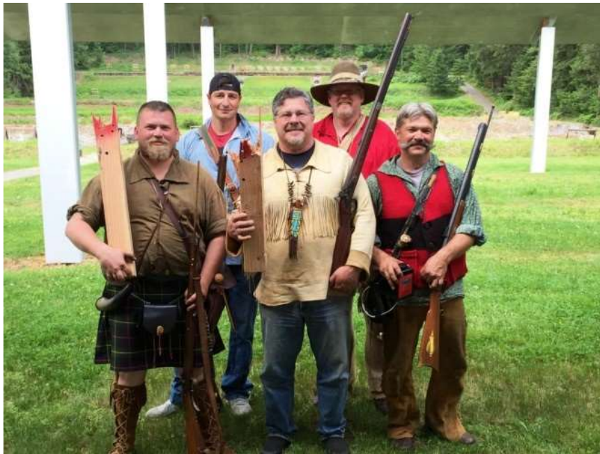
The Plainsmen win the Stake Shoot

had an elk hide on the frame and used a bit of Tom Sawyer whitewashing to get folks from the audience to help with the hard labor.