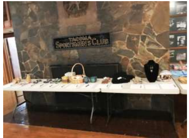
Some of the items for the Silent Auction

We are already booked for next year's event so mark your calendar for March 23 rd , 2019.