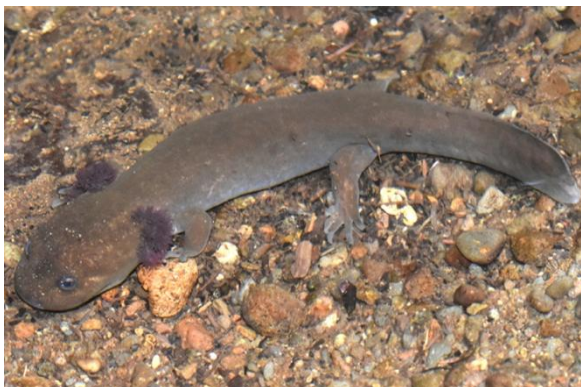
Coastal Giant Salamander