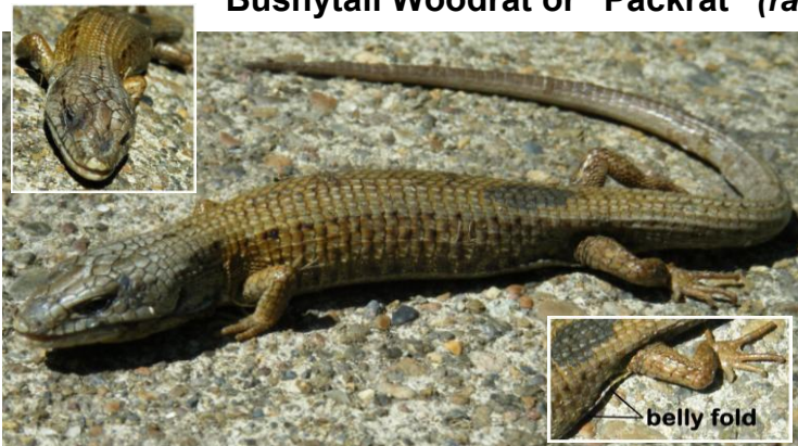
Northern Alligator Lizard (scaly)