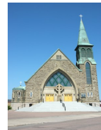
Saint Augustine's 340 Dominion Street Moncton, NB

January 20, 2019 Second Sunday in Ordinary Time