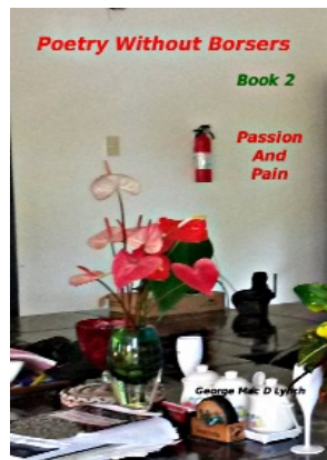
Book 2 - Passion And Pain