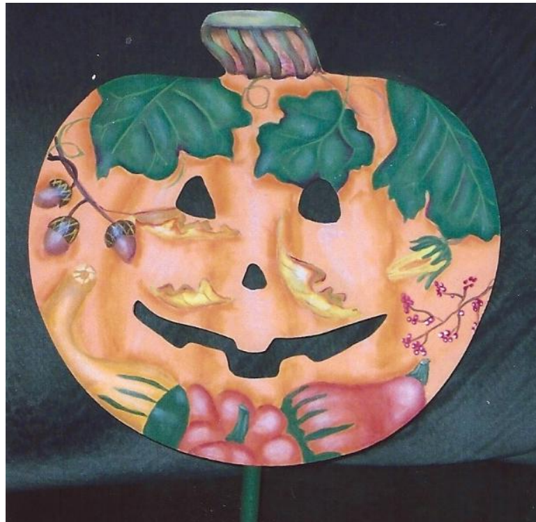
4 hours - Ellen Belisle “Pumpkin Mask” Level: Intermediate Medium: Acrylic Size/Surface: 10” x 9½” Wood Supplies: Regular painting supplies Cost $15.00