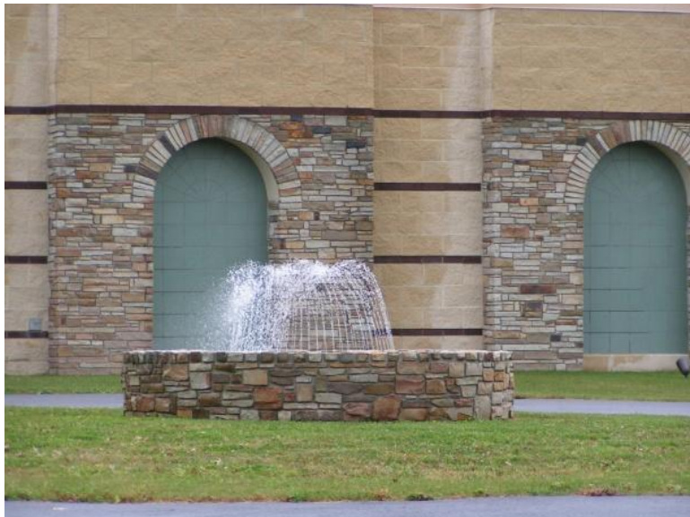
Fountain at Antiochian Museum