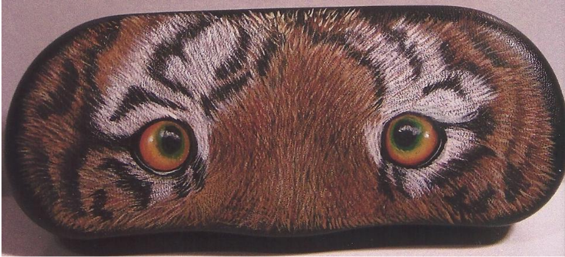
4 hours - Rosemary Habers “Tiger Eyes“ Level: Beginner/Intermediate/Advanced Medium: Acrylic Size/Surface: 6½ X 2½ Eyeglass Case Supplies: Normal painting supplies Cost $15.00