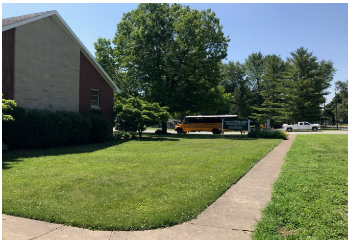
Wabash City Schools delivering lunches

We welcome all who are on the journey to know Jesus, who share in his love and who choose to embrace the diversity within this community of believers. As individuals we may be at different places along the path, but as a community, we are all traveling together in faith, trusting God to show us the way.