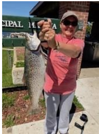
Sculpin - 6.60# Brown Trout - 6/22/19