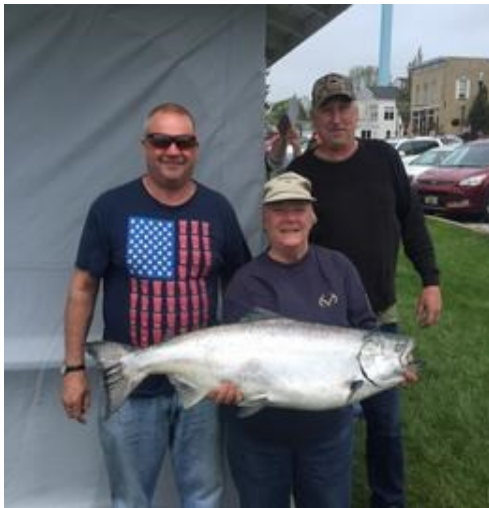
Producer - 25.6# King - 5/25/19