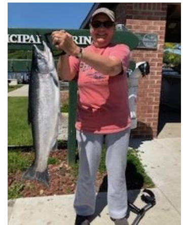
Sculpin - 10.60# Steelhead - 6/22/19