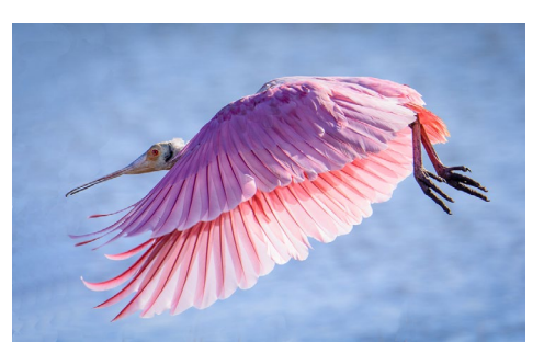
Roseatte Spoonbill - 27 Dolph McCranie