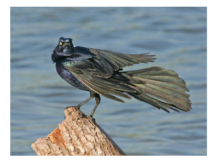
Agitated Great Tail Grackle - 27 Lewie Barber