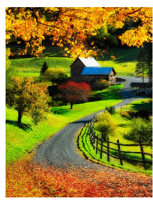
Vermont Farm - 27 Phil Charlton