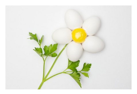
Sunny Side Up - 26 Cheryl Callen