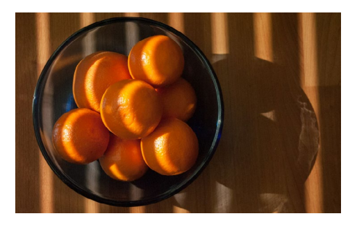
Orange Still Life - 27 Shari Favela