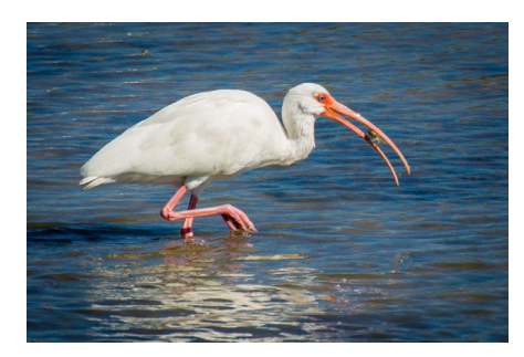
White Ibis and Crab - 26 Beverly McCranie