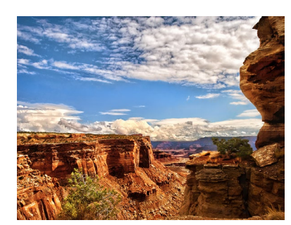
Canyonlands Vista - 27 Nancy Naylor