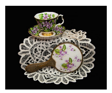
Petals of Purple - 26 Barbara Hunley