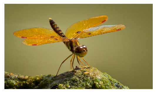
Ready for Flight - 27 Leslie Ege