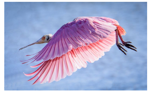
Roseatte Spoonbill - 27 Dolph McCranie