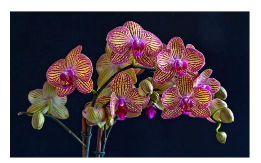
What I Learned in ASC Workshop - 27 Lois Schubert