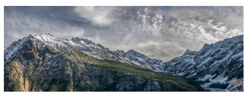
View from Washington Pass - 27 Pamela Walker