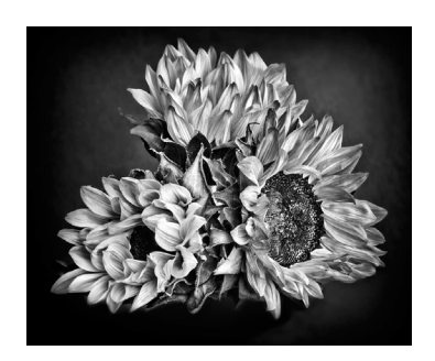
Sunflowers in Black & White - 27 Lois Schubert