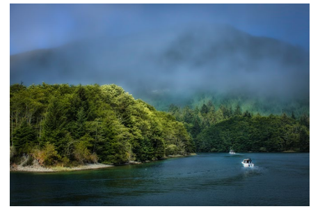
Into the Fog - 27 Rose Epps