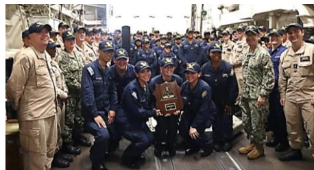
Bravo Zulu USS GRAVELY crew!

On September 17th, Captain Edward J. Pledger, Commodore, Destroyer Squadron 22, presented the crew with the 202 Commander Naval Surface Force Atlantic Battle Effectiveness, or Battle "E", award. The Battle "E" is awarded annually to commands that exhibit the highest state of readiness amongst competitors in the fleet. Bravo Zulu to the crew for another recognition well-deserved! 🚩