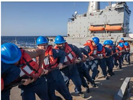
Sailors heave around to seat a refueling probe as Gravely conducts an underway replenishment with the USNS Kanawha (T-AO-196) in the Red Sea.