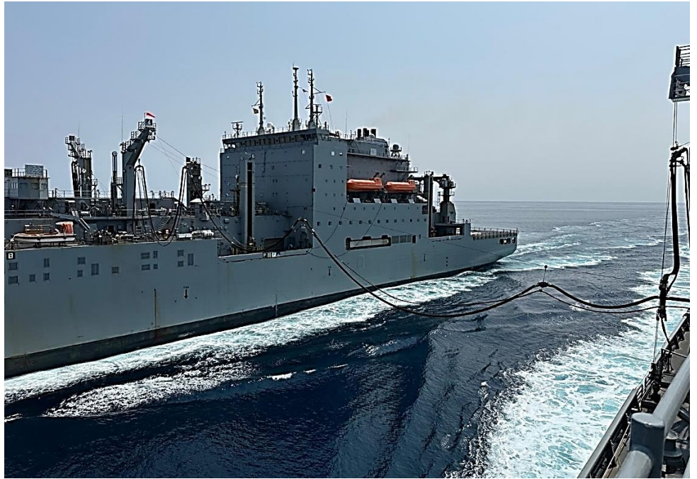
USNS SUPPLY (T-AOE-6) receiving fuel alongside USNS ROBERT E. PEARY (T-AKE-5).