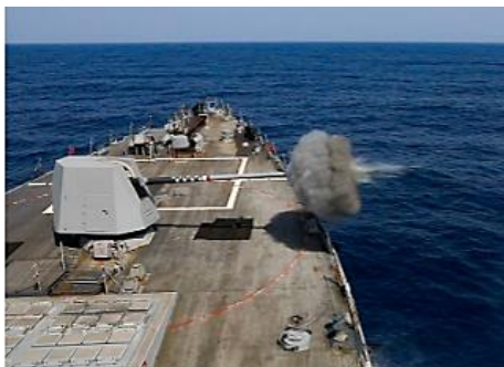
Gravely conducts a pre-action calibration fire of the 5-inch gun in the Red Sea.