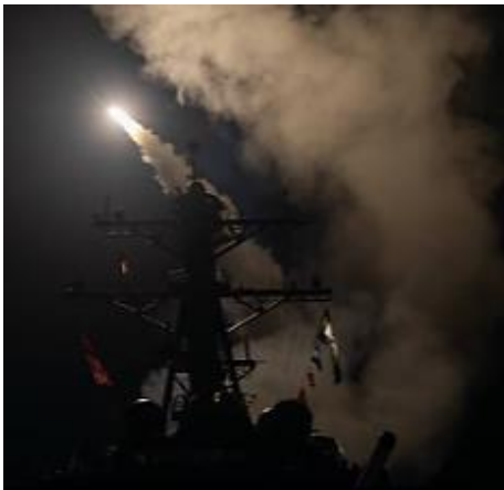
Gravely launches Tomahawk Land Attack Missiles in response to increased Iranian-backed Houthi malign behavior in the Red Sea.