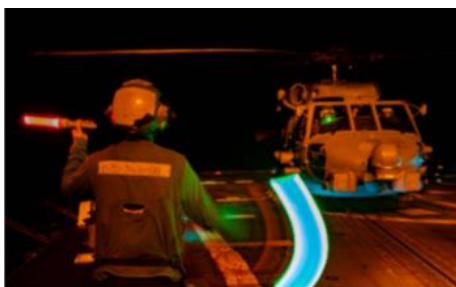
Gravely conducts night flight operations

in the Red Sea.