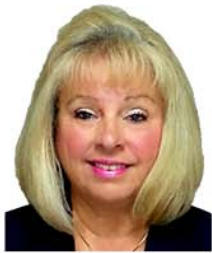
Multi Million Dollar Producer