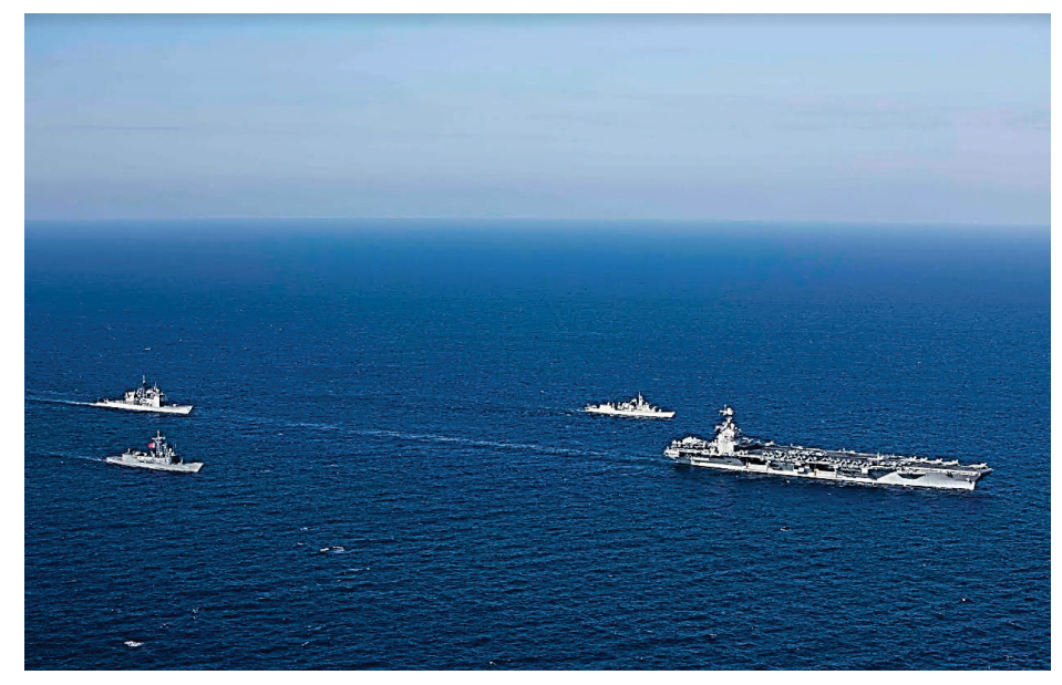
USS NORMANDY on deployment with GERALD R. FORD Carrier Strike Group.

Currently in port getting ready for inspection and sea trials. NORTHLAND will deploy around October 28<sup>th</sup>.