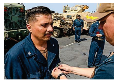
As always, CARTER HALL crew wishes to extend their gratitude for

the ongoing support of the Richmond Navy League.