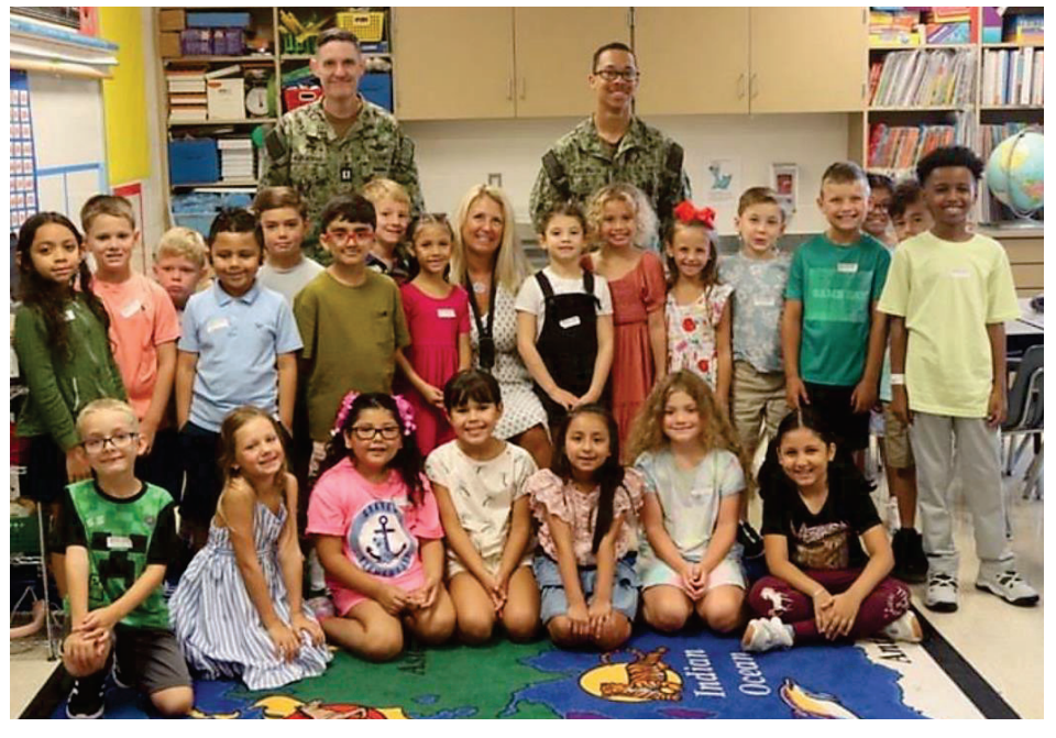
USS GRAVELY Sailors enjoyed the kids first day of school at Gravely Elementary School in Haymarket, VA.

In late August GRAVELY Sailors had a first day of school with Gravely Elementary School students. During their visit, Sailors assisted faculty and staff in the classrooms, ate lunch with the students and enjoyed some outdoor activities during recess.