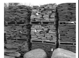
Natural Stone Yard