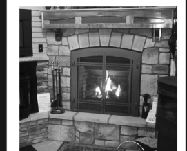
Fireplace Shop: Wood & Gas

www.American-Home.com • 1270 Mentor Ave. • Painesville Twp. • Across from Lake County Fairgrounds