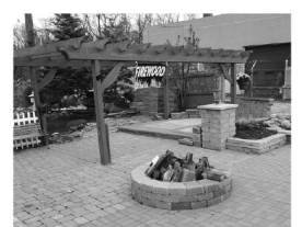
Decorative Brick Patios & Fire Pits