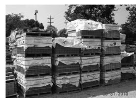
Brick & Retaining Wall Yard