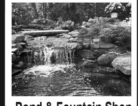
Pond & Fountain Shop