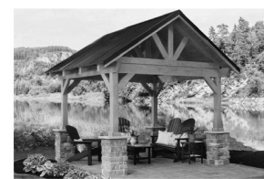
Pavilions & Pergolas