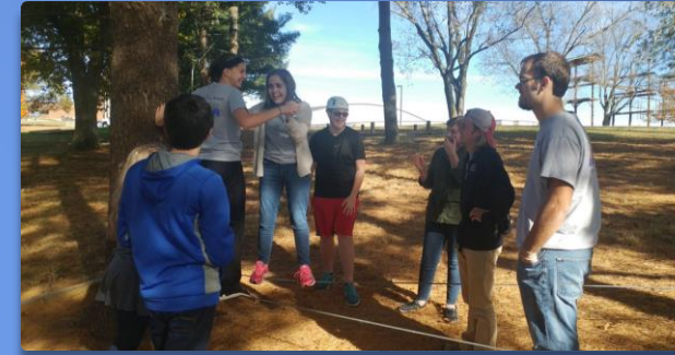
Officers spot one another during the last exercise of the day