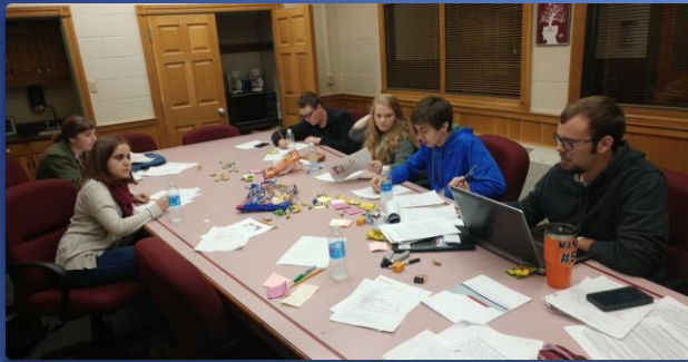
Officers Develop Plan of Work