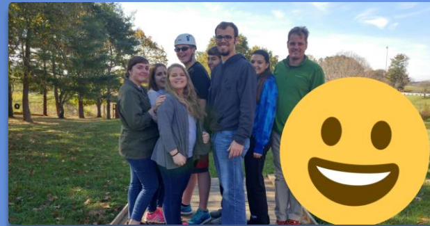
Team conquers another team building activity “The Boat”