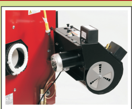
Patented burner technology

With Clean Burn Coil Tube Boilers, you spend 30 minutes cleaning every 750-1000 hours of operation. With competitive units, you spend 2 hours cleaning every 400 hours of operation.