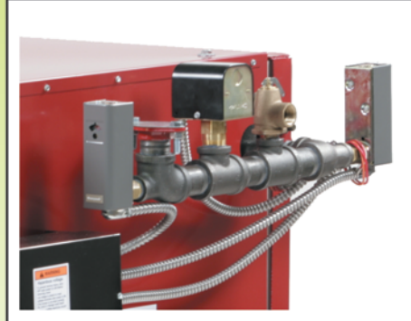
Wired, plumbed for installation

The Clean Burn burner swings out for easy cleaning, maintenance and service. An exclusive heater block, atomizer and combustion mechanism make Clean Burn unmatched for reliability, performance and long service life.