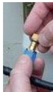
PRESSURE RELIEF VALVE for Let-By & Tightness Testing