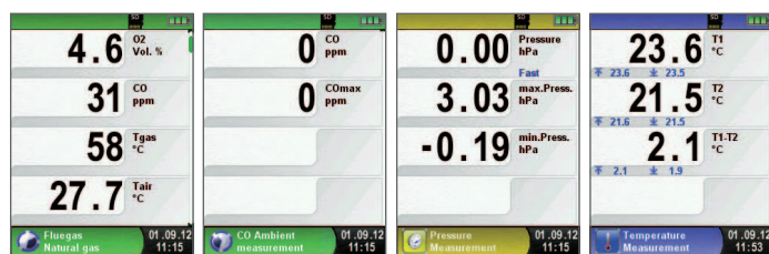
Flue gas menu