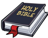
2 Timothy 2:15