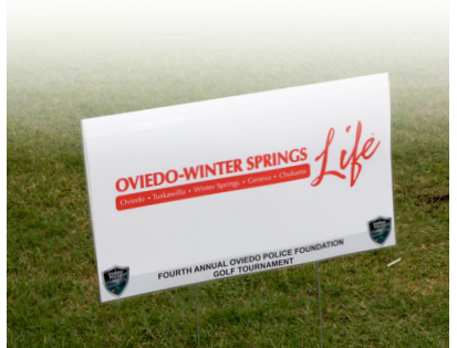
The Oviedo Police Foundation is a registered 501(C)3 organization