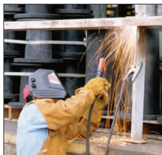
DC stick welding