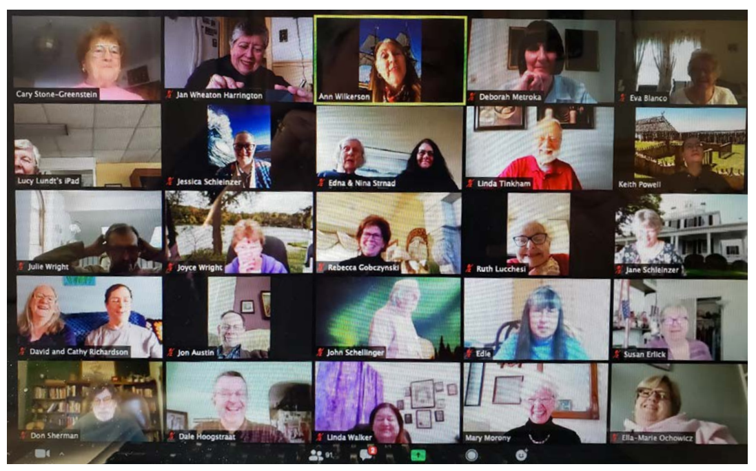
What would our Mayflower ancestors think of Zoom? Hopefully we will gather together next November and resume our Family Photos and installing new members in person.