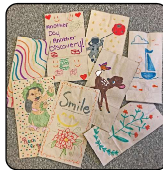
Examples of decorated food bags

Evan's presentation will discuss childhood hunger