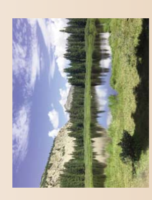
Join the Best in the West! July 22-23, 2019

4380 S Syracuse St Ste 110 Denver, ĆO 80237-2623 Denver Tax Institute