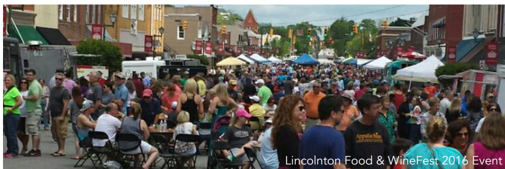
Lincolnton Food & WineFest 2016 Event