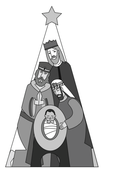
A Light to the Nations

STAND FOR ISRAEL aims to engage people both spiritually and politically on behalf of Israel and the Jewish people by encouraging prayer for Israel and teaching others to advocate for the Jewish state.