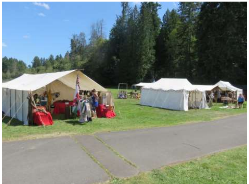
This was only some of the traders along Trader's Row