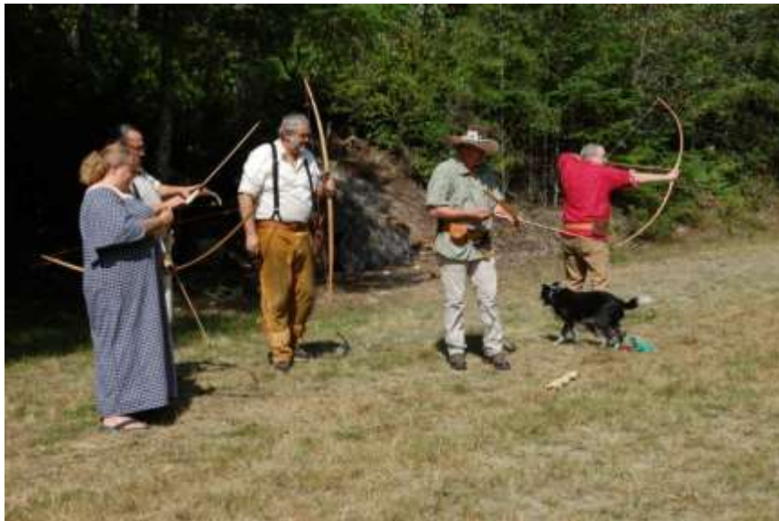
The Outcasts trade their muzzleloaders in for bows