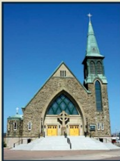
Saint Augustine's Moncton