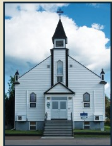
Our Lady of Mercy Pointe-du-Chêne