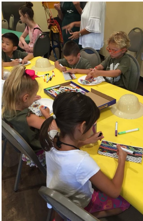
The children at Woodland Oaks made colorful pencil cases and school packs for the children at Hannah's Hope to use when they head back to school.