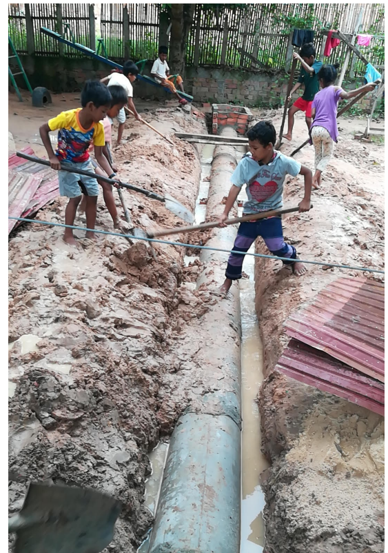
Helped with laying of new sewer pipe.