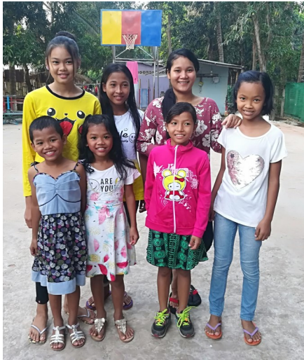
Heading to Wednesday night church.