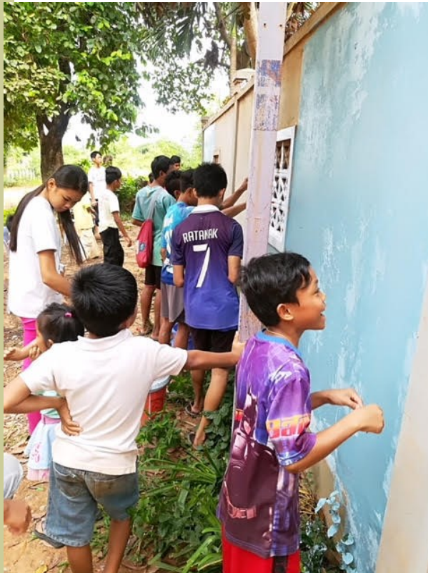
Painted the outside of their home.