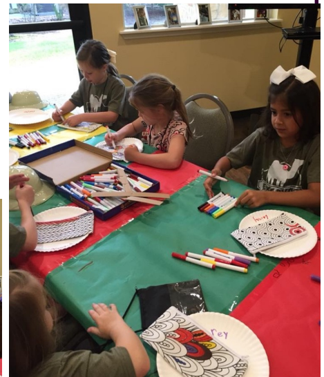
The children at Woodland Oaks collected $273.00 to purchase school supplies for the children at Hannah's Hope.