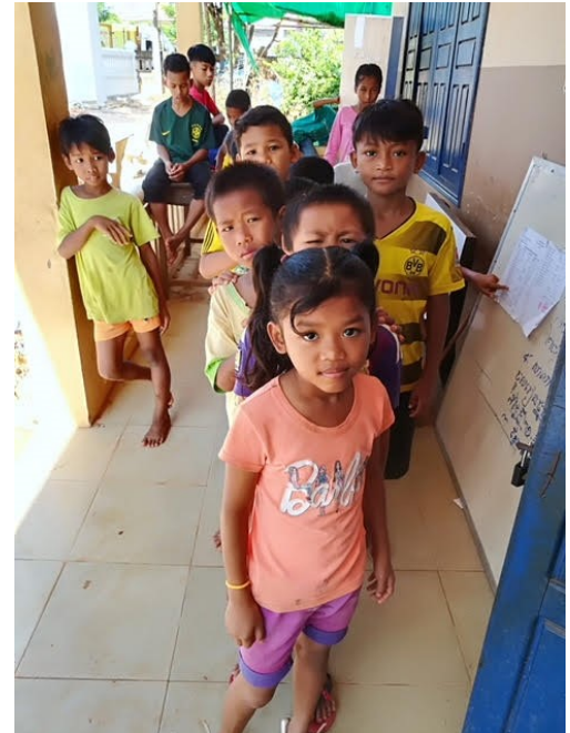
The children are waiting to get their uniforms for school.