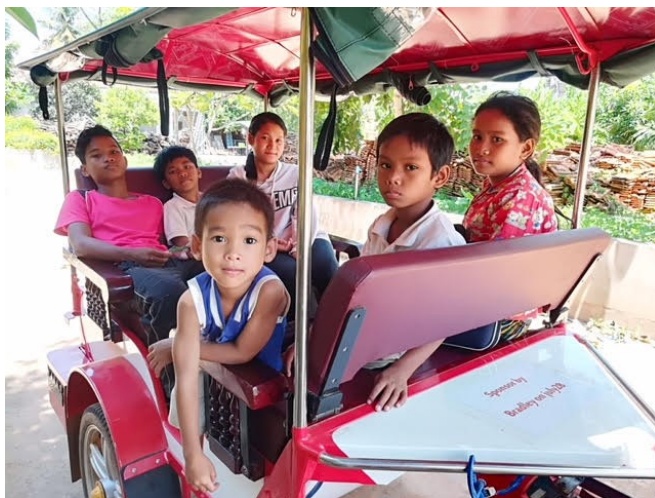
The tuk tuk is used to transport children to school.

Please continue to pray for the work at Hannah's Hope as it is touching the lives of many children. Pray for God's guidance, God's wisdom, and God's direction. Most importantly, pray each of these children will grow into faithful Christian men and women who continue to spread the gospel.