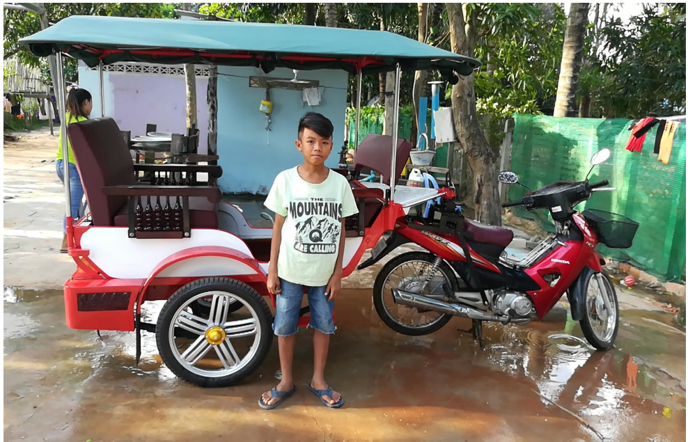
A new tuk tuk was purchased to be used by the staff of Hannah's Hope.