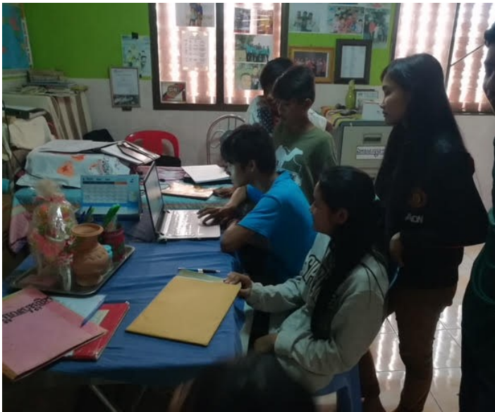
A computer was purchased to help the children develop their technical skills for the workplace and future employment.