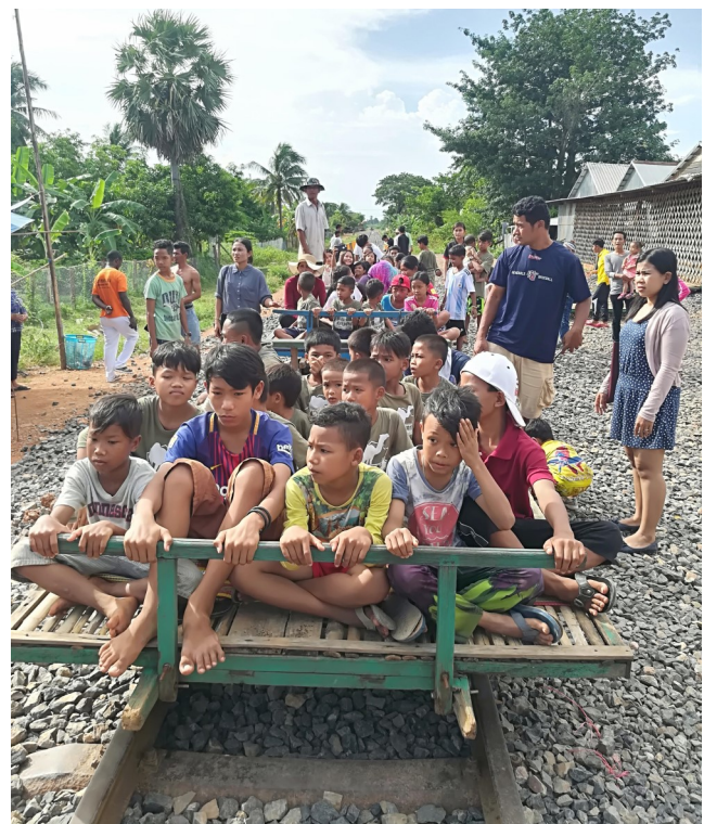
Riding the Bamboo train.