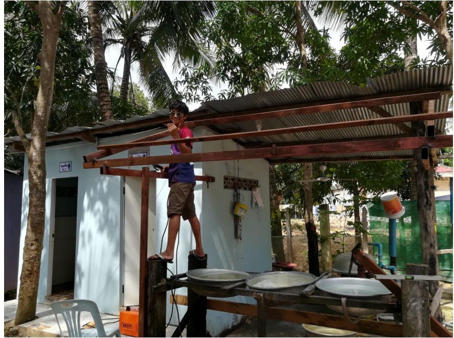
Built cabana over table and wash area.