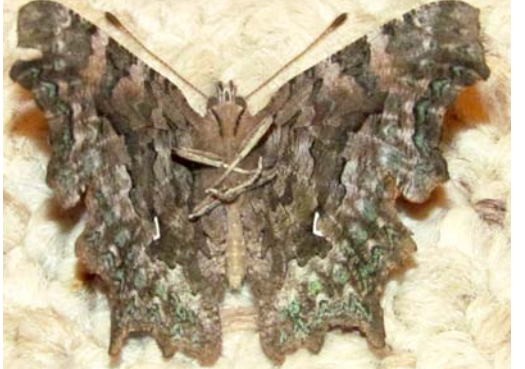
GREEN COMMA BUTTERFLY Polygonia faunus (Outer wing margins irregularly toothed, unique pattern of spots on top, underside grayish)