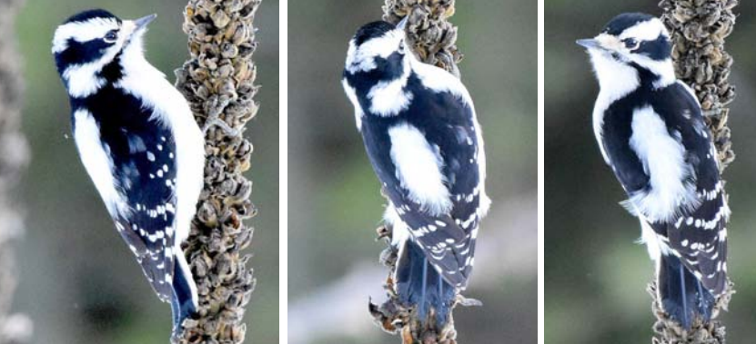
color and pattern very similar to Hairy Wodpecker)