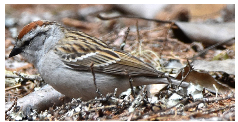
CHIPPING SPARROW Spizella passerina