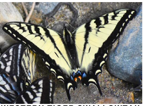
BUTTERFLY Papilio rutulus