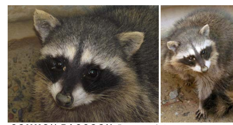
COMMON RACCOON Procyon lotor (Black face mask, rings on tail)