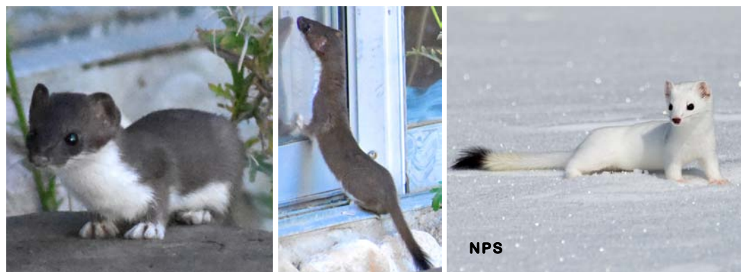
SHORT-TAILED WEASEL Mustela erminea (Turns all white in winter except black tail tip)