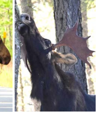
MOOSE Alces alces (Large, ungainly, dark brown body, gray legs, big overhanging snout, distinctive "palmate" antler)