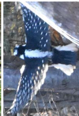
DOWNY WOODPECKER Dryobates pubescens (Short bill, HAIRY WOODPECKER Dryobates villosus (Male has red patch on back of head, body larger than Downy Woodpecker and bill much longer)