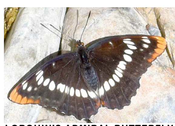
LORQUIN'S ADMIRAL BUTTERFLY Limenitis lorquini