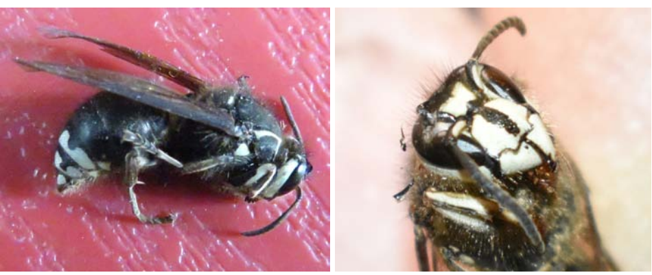
BALD-FACED HORNET Dolichovespula maculata (Builds above-ground paper nests in trees, bushes and under eves)