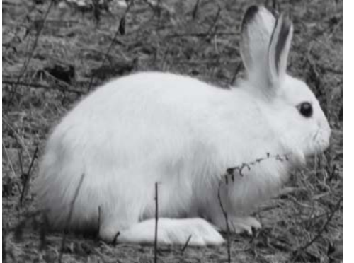
SNOWSHOE HARE Lepus americanus (Brown-gray in summer, turns all white in winter except black ear tips, very large hind feet)