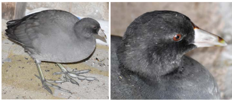
AMERICAN COOT Fulica americana (Rare visitor from lake, "chicken-like" in appearance)