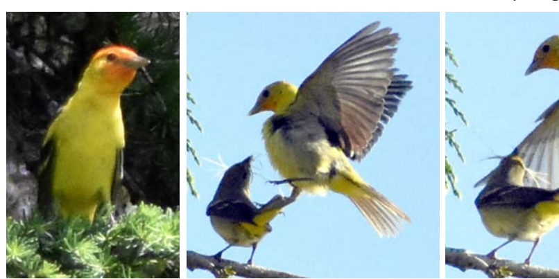
WESTERN TANAGER Piranga ludoviciana