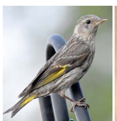
PINE SISKIN Spinus pinus