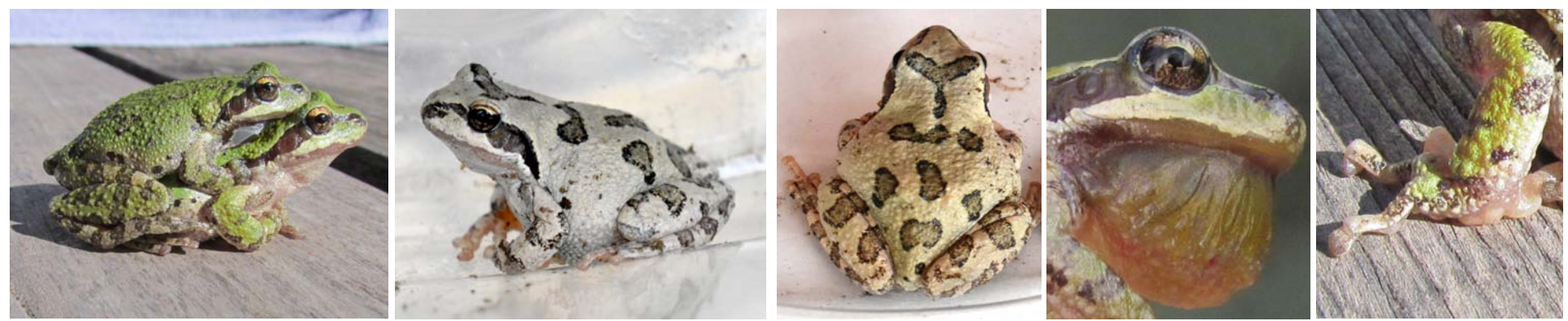
SIERRAN TREE FROG Pseudacris sierra (Small frog, less than 2", black or dark brown eye stripe from nose across eye to shoulder, color variable green to gray or brown, pads on toe-tips)