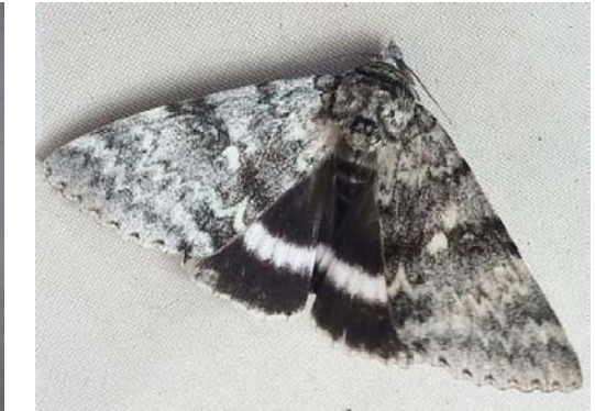
WHITE UNDERWING MOTH Catocala relicta