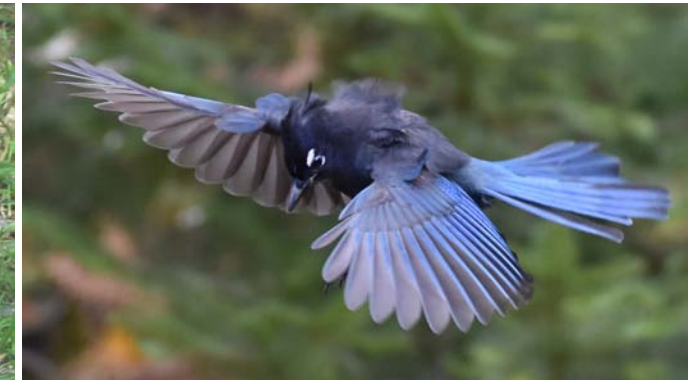
STELLER'S JAY Cyanocitta stelleri (A camp robber)