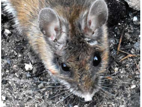
DEER MOUSE Peromyscus maniculatus (White feet and belly, tail dark above and white below and as long as rest of body)