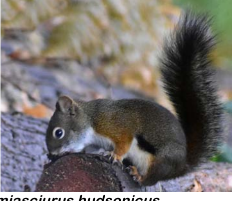
AMERICAN RED SQUIRREL Tamiasciurus hudsonicus (Ear tufts, black side stripe between the white belly and gray back)