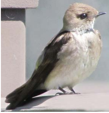
TREE SWALLOW Tachycineta bicolor (White throat and breast, white doesn't extend above eye, back blue-black, immature grayish, catches insects in flight)