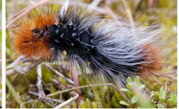
RANCHMAN'S TIGER MOTH Arctia virginalis