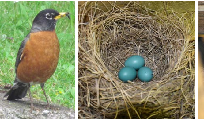
AMERICAN ROBIN Turdus migratorius