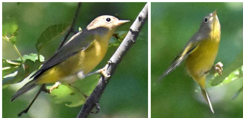
NASHVILLE WARBLER Oreothlypis ruficapilla