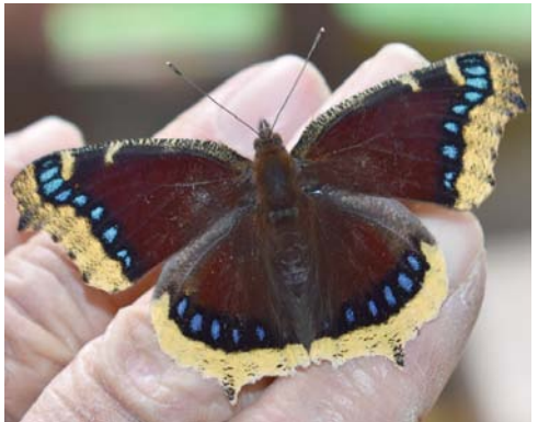
WESTERN TIGER SWALLOWTAIL MOURNING CLOAK BUTTERFLY Nymphalis antiopa