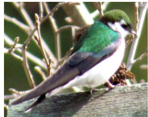
VIOLET-GREEN SWALLOW Tachycineta thalassina (White extends above eye, back green-black, white rump patches in flight)