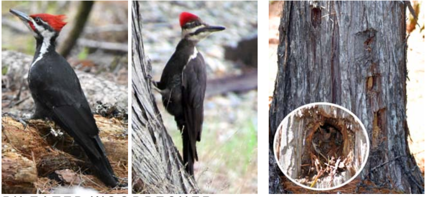
PILEATED WOODPECKER Dryocopus pileatus (Almost big as a crow, male has red stripe on cheek, pecks squarish holes in tree trunks, fast "wuk" series call)