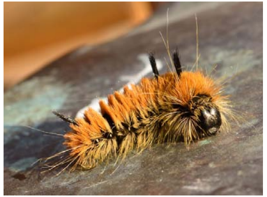
FINGERED DAGGER MOTH Acronicta dactylina