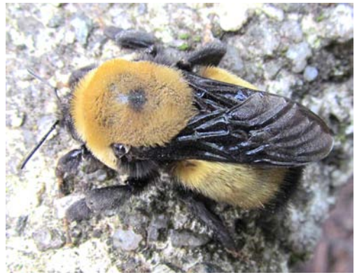
NEVADA BUMBLE BEE Bombus nevadensis (Furry body, larger than honey bee)

These are some of the animals most likely to be seen on Gold Hill, but not all. You can download this document at (http://www.campgroundcritters.com). For more details on Idaho Wildlife, download the Idaho Dept. of Fish and Game Species Guide at (https://idfg.idaho.gov/species/) or the Idaho State Univ. "Atlas of Idaho's Wildlife" at (https://digitalatlas.cose.isu.edu/bio/atlswf.pdf).