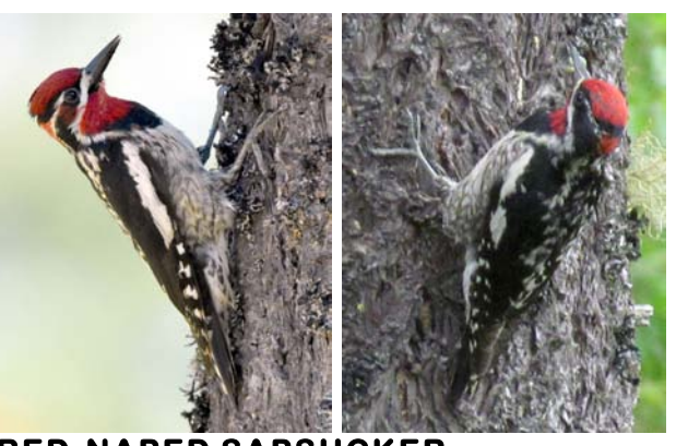
RED-NAPED SAPSUCKER Sphyrapicus nuchalis