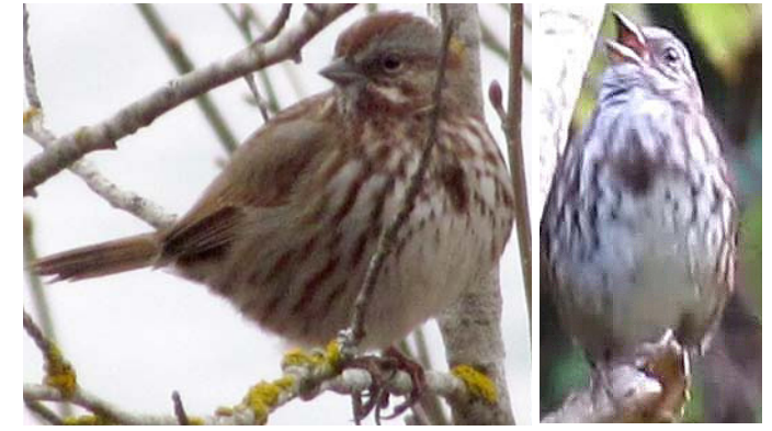
SONG SPARROW Melospiza melodia (Distinctive breast Spot, melodious song)