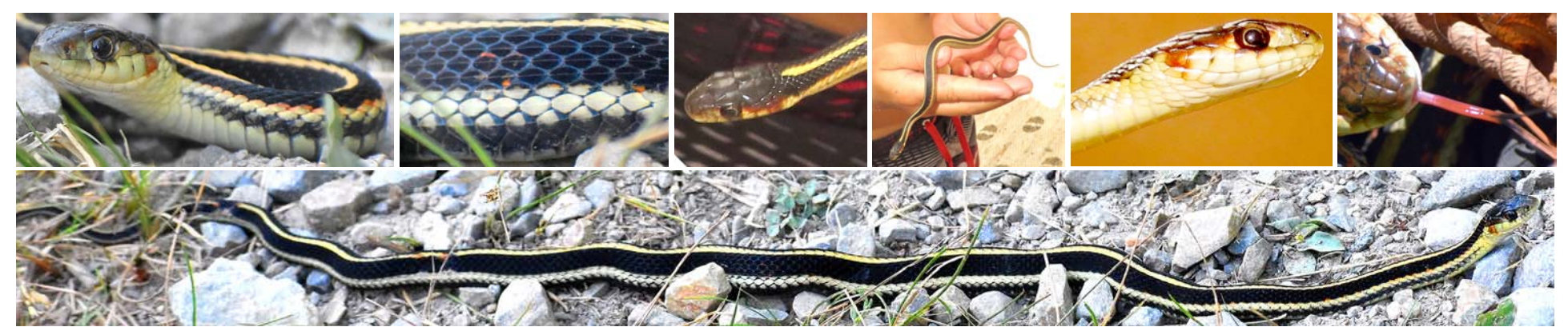
COMMON GARTER SNAKE Thamnophis sirtalis (Variable color but usually with dorsal and lateral stripes and red blotches on sides)