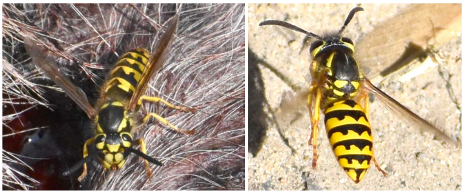
WESTERN YELLOWJACKET Vespula pensylvanica (Nests underground or in hollow trees and logs)