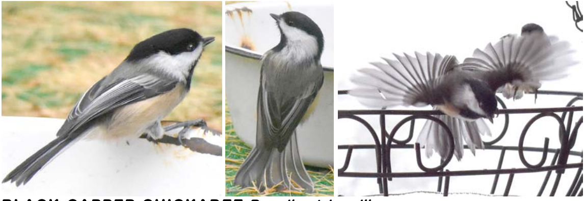
BLACK-CAPPED CHICKADEE Poecile atricapillus