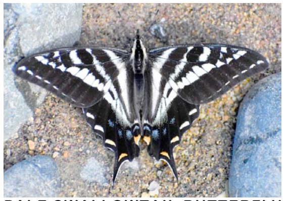
PALE SWALLOWTAIL BUTTERFLY Papilio eurymedon