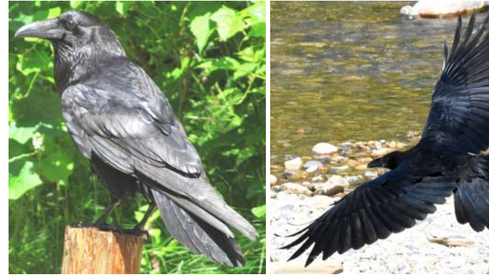
COMMON RAVEN Corvus corax (Larger than crow, heavier bill, back of tail rounded or "V" shaped in flight)