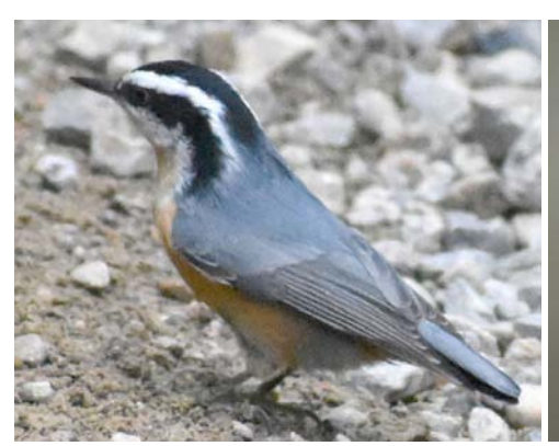
RED-BREASTED NUTHATCH Sitta canadensis