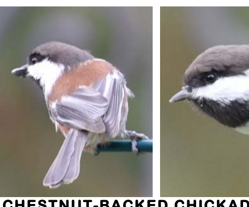
CHESTNUT-BACKED CHICKADEE Poecile rufescens