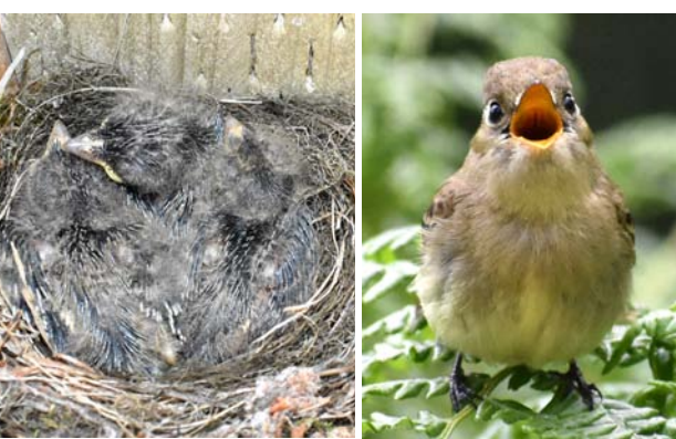
CORDILLERAN FLYATCHER Empidonax occidentalis