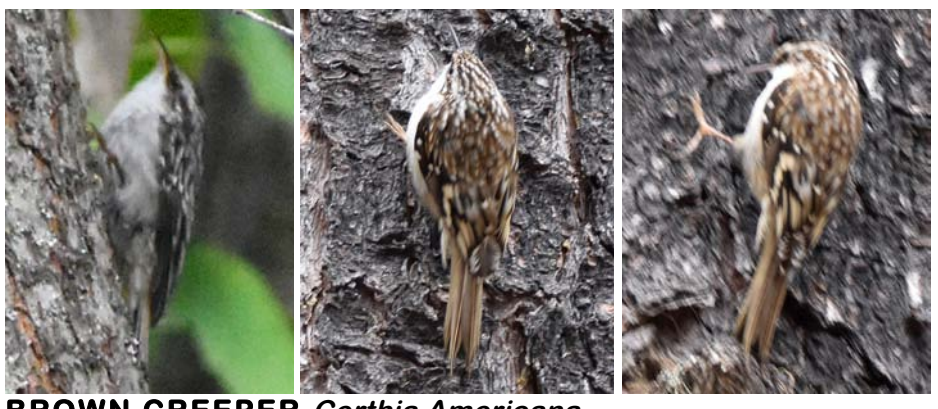
BROWN CREEPER Certhia Americana