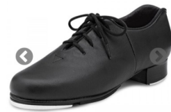
BLOCH S0381L Audio Jazz Tap

These shoes are available locally at Threadbare Dancewear.