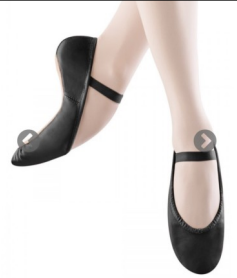
BLOCH S0205G Danceoff - Kids

These shoes are available locally at Threadbare Dancewear.