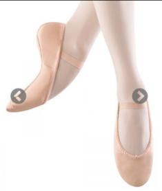
BLOCH S0205G Danceoff - Kids Girls

These shoes are available locally at Threadbare Dancewear.