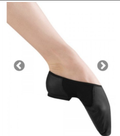
BLOCH S0495L Neo-flex Slip On

Hip Hop-Boys/Girls-All levels: Hair pulled back in a pony tail, braid or bun.