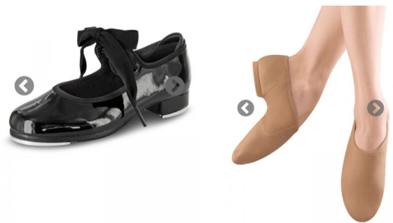
BLOCH S0350G Annie - Girls

These shoes are available locally at Threadbare Dancewear.