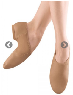
BLOCH S0495L Neo-flex Slip On