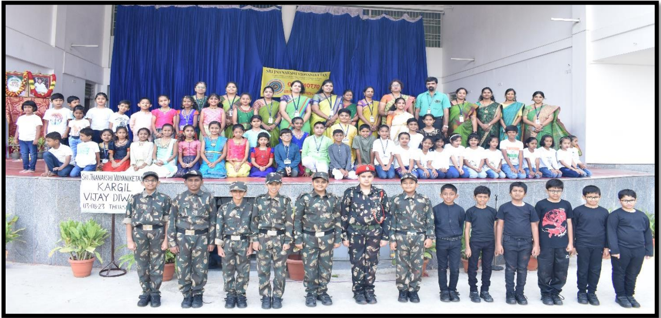
YOUNG SOLDIERS OF SJV