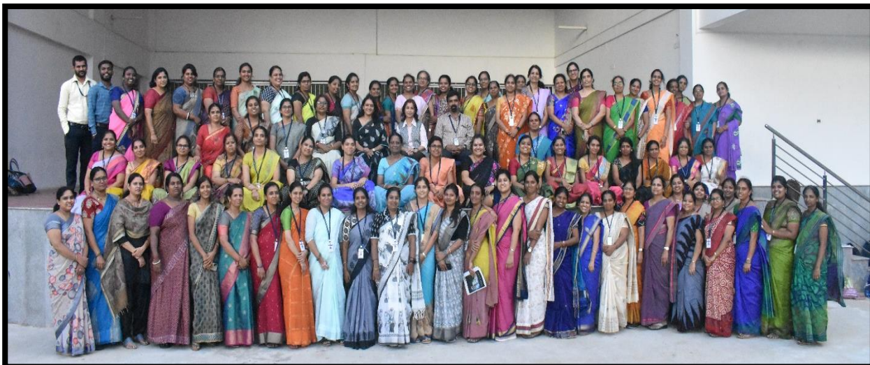
PARTICIPANTS OF THE COE WORKSHOP