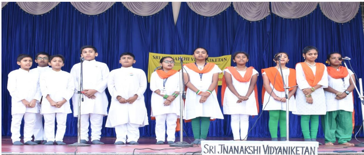
CHILDREN SINGING A PATRIOTIC SONG

SRI JNANAKSHI VIDYANIKETAN KARGIL VIJAY DIWAS 02-08-23 WEDNESDAY