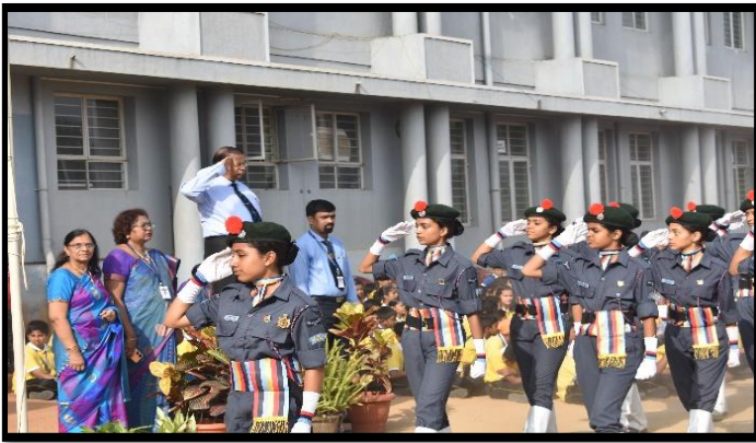
NCC CADETS SALUTING THE DELEGATES