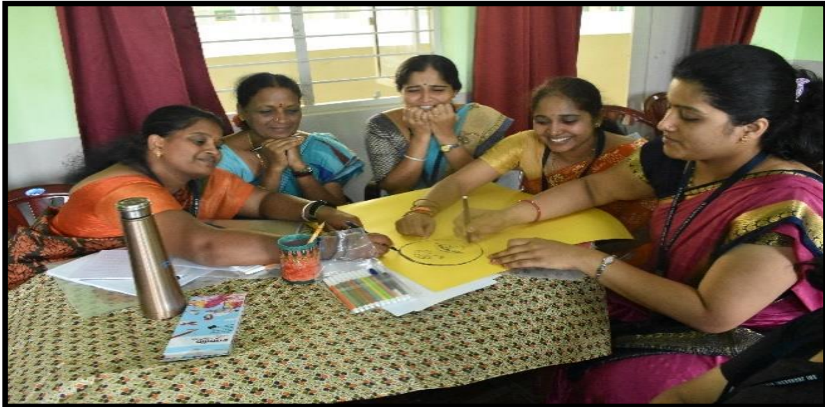
TEACHERS INVOLVED IN AN ACTIVITY