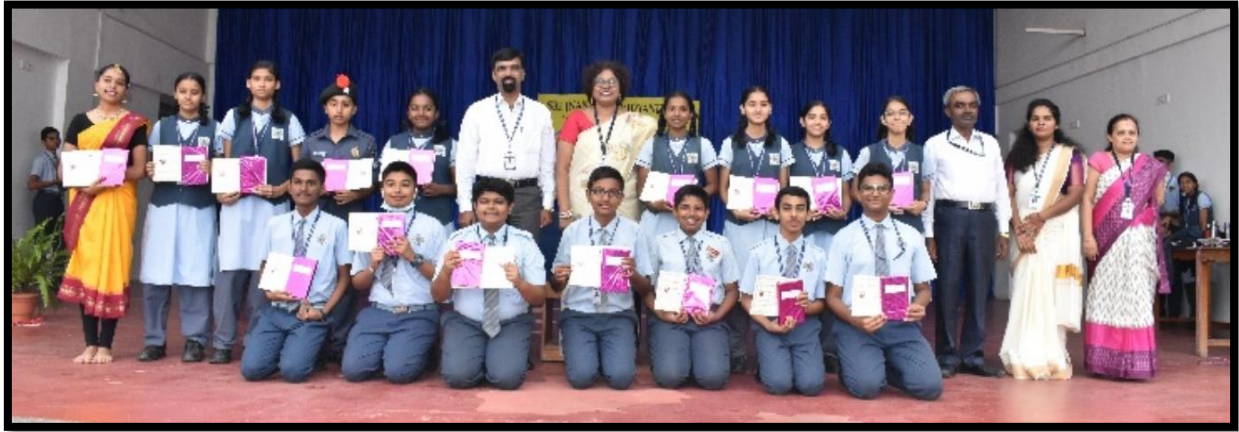
‘PROUD VORACIOUS AND INQUISITIVE READERS OF SJV’