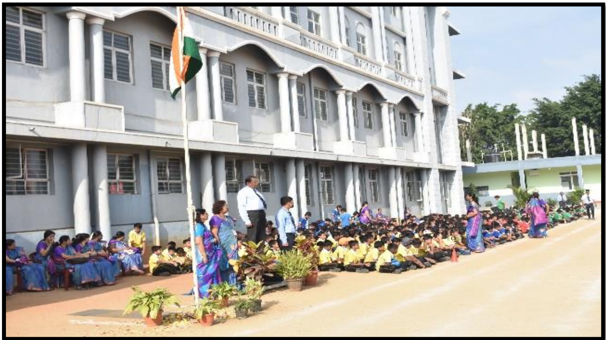
THE DELEGATES OVERSEEING THE MARCHPAST

The celebration was a grand display of patriotism truly conveying the message, "Nation first always first". Jai Bharath!