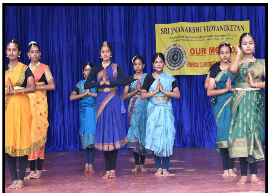
FATHER OF LIBRARY SCIENCES SHRI S.R. RANGANATHAN STUDENTS INVOKING THE BLESSINGS OF MATA RAJARAJESHWARI AND SRI SRI SRI TIRUCHI MAHASWAMIGAL