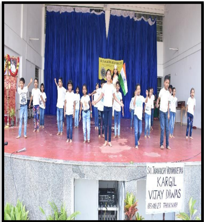
CHILDREN DANCING TO A PATRIOTIC SONG