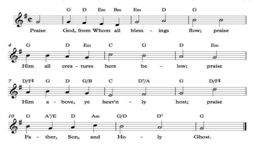
Doxology, written in England for Protestant Churches in 1674.

As the offering is brought forward, we will sing the Doxology.