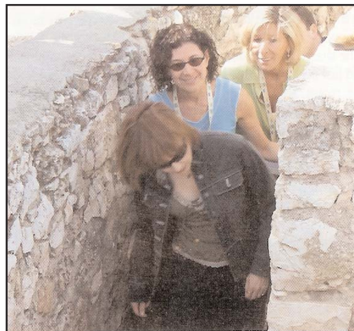
Visitors to Ammunition Hill learn how the hill's trenches were used during the Six-Day War

Standing on this idyllic stretch of land among the pine trees, overlooking Jerusalem, it is hard to believe that Ammunition Hill was the site of one of the fiercest battles of the Six-Day War. "The guides at Ammunition Hill help re-create the battle for Jerusalem with their detailed story-