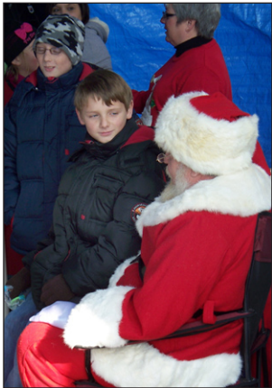
I want a Lego City Airport...

Over the past 6 years on the 2nd Saturday in December, the Buckeye Lake Community