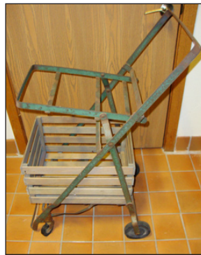
Fitches Grocery cart 1920's

Thanks in part to our many donors, the museum displays are always fresh. That makes our museum a great place to wander about, year after year. You will always find something new on every trip.