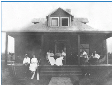
Wigwam Cottage at the lake.

Joyce, I read your article with much enthusiasm. Wonderful pictures of the guests and cottages from