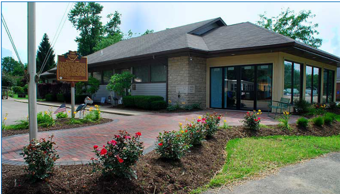
Beautiful all glass, front addition, to the Museum.

The Norma Dixon addition is completed. It has added a new dimension to the look and feel of the historical society. The glass structure with its high ceiling and brick memorial patio is breathtaking. The landscaping and new location of the flag pole brings stares from the folks driving by. The lights shining on the "Rocket Ship" in the evening hours make the entire structure just POP!