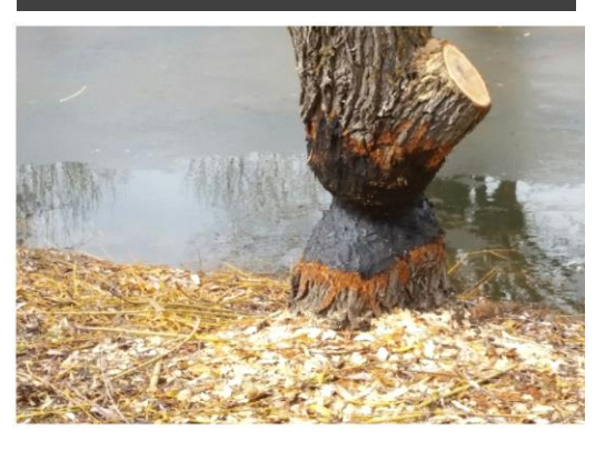
Beaver damage This is one of the trees that was damaged along the pond.