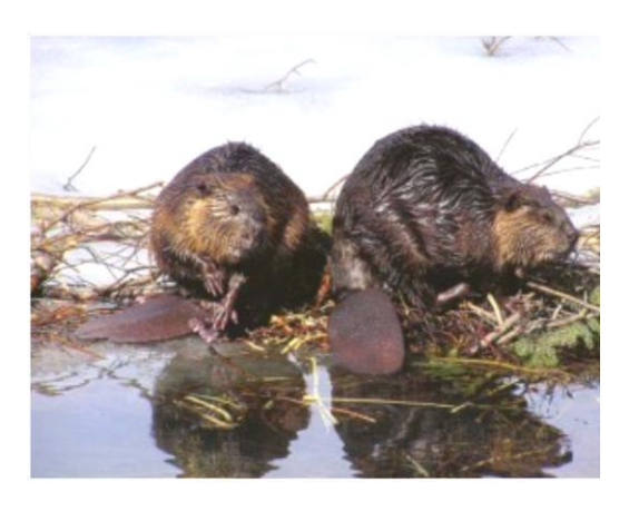
Beavers These aren't the actual Beavers that were in the park. These guys are stunt doubles.