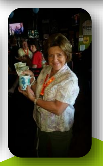
Lopez & Lefty's 1759 S. Claudina Way Anaheim, CA 92805