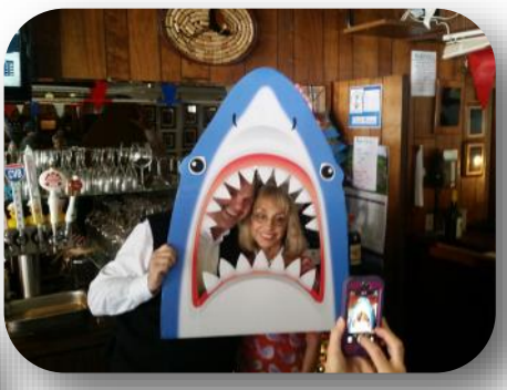
Shark Infested Waters