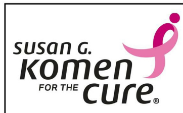
Our Charity for the October Galaxy Diner Cruise-In