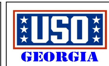
Our Charity for the September Galaxy Diner Cruise-In