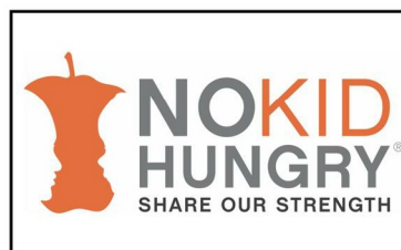
A favorite charity of Our Supporter, Joe's Crab Shack!