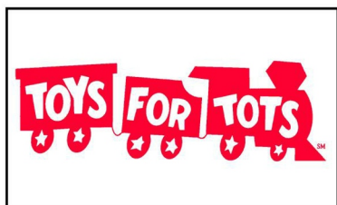
Our Charity for the November Galaxy Diner Cruise-In