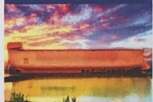
Enjoy a visit to the Famous Ark Encounter!