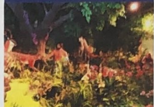
Visit to the Amazing Creation Museum!