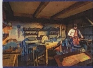
View from Inside the Ark Encounter