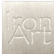
Brushed Nickel IT 201 - Group I