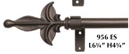
956 ES L6 1/4" H4 1/4"