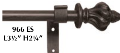
966 ES L3 1/2" H2 1/4"