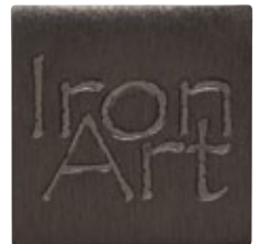
Black Nickel IT 202 - Group K