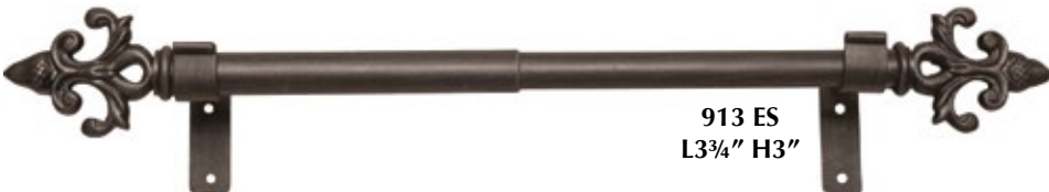
913 ES L3 3/4" H3"

Rod diameter is a combination of 1" & 7/8"