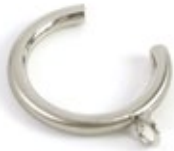
7330C "C" RING (Shown in Polished Chrome)