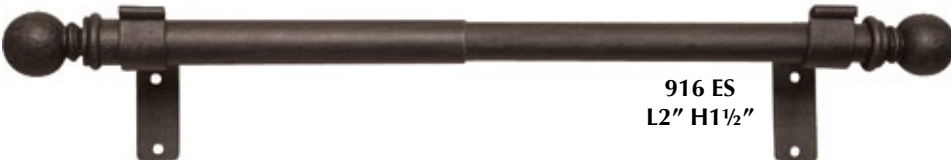
916 ES L2" H1 1/2"