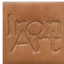
Oiled Bronze IT 203 - Group K