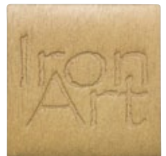
Satin Gold IT 205 - Group K