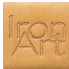
Satin Copper IT 204 - Group K