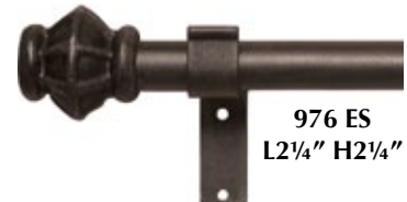
976 ES L2 1/4" H2 1/4"