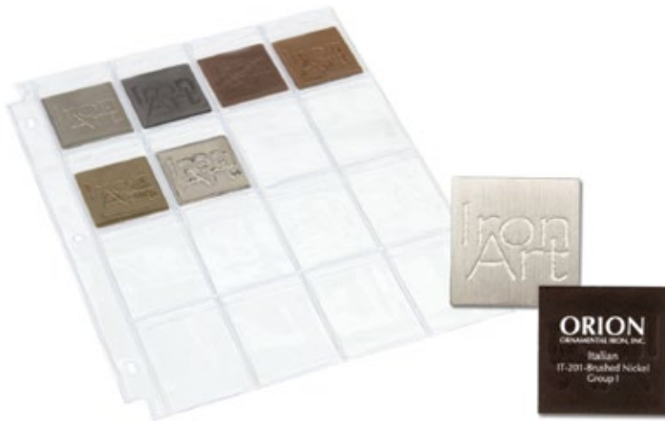
8014 Italian Finish Selector Set All six finishes in a plastic binder sleeve