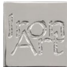
Polished Chrome IT 206 - Group J