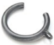
330C "C" RING