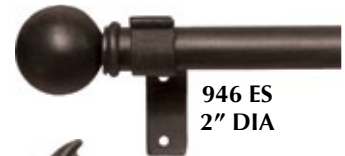
946 ES 2" DIA