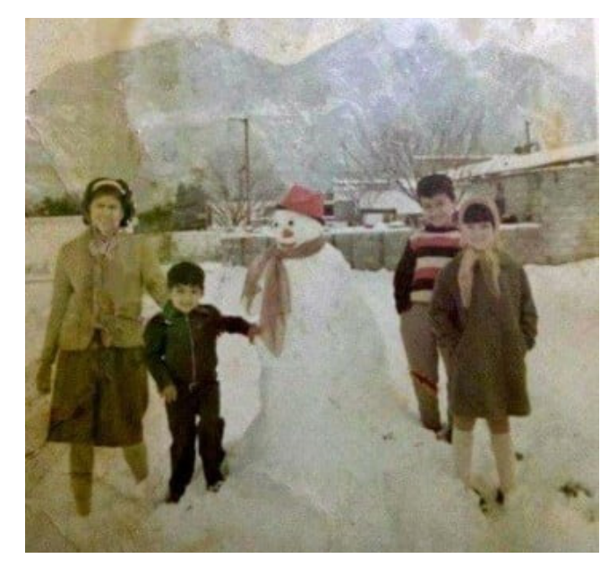
Picture of the snowffall of 1967 in Paricutin cross with 2 de Abril streets, Monterrey, Mexico

Because of a picture of children playing during the snowfall of 1967, taken precisely in this crossroad. That historical event that links their lives with the lives of children on a different side of the globe. Plus, the names of the streets are so perfectly matching. Paricutín is the name of a volcano that suddenly arose out of the cornfield of farmer Dionisio Pulido in 1943. I mean, literally in the course of one day, this guy heard thunders from under the ground, witnessed the fracture of his fields, and saw the creation of a crater from which a whole mountain grew. WTF? Just an amazing story. The Paricutín was active for nine years