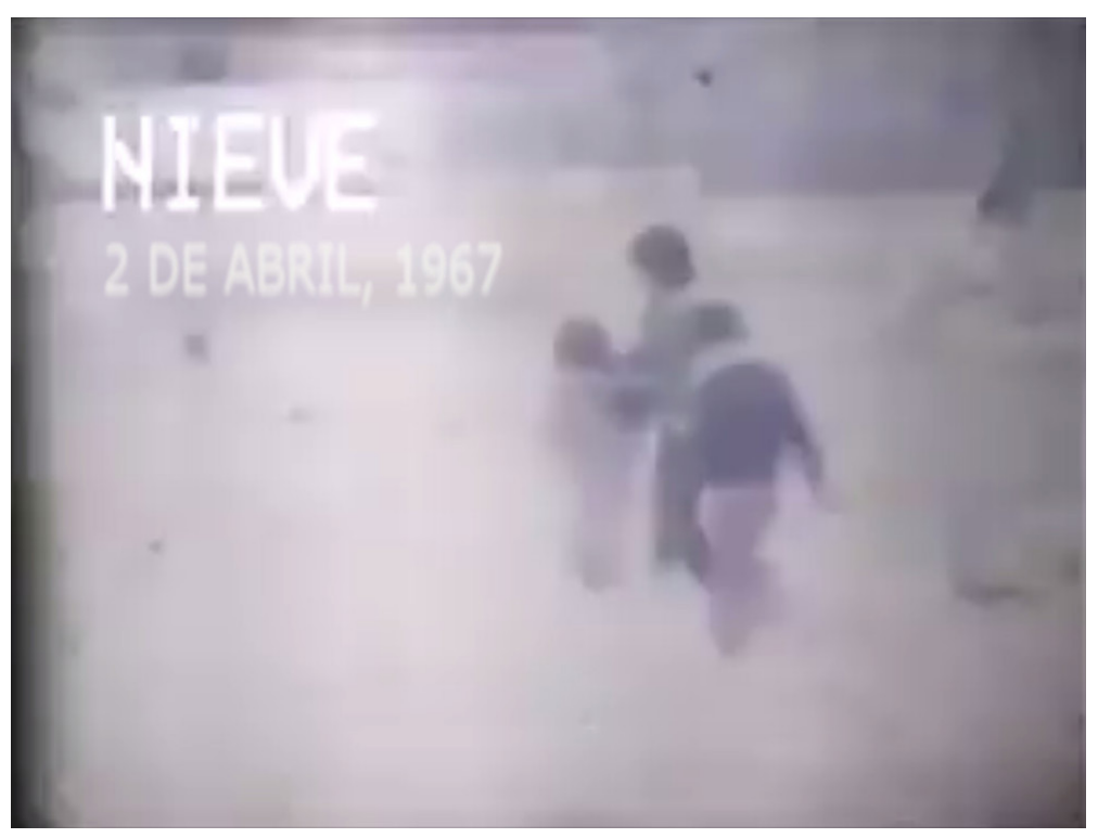
Still of video Lost in a snow storm, we are friends

Let's talk about the video Lost in the snow storm, we are friends. The thing that I call moment of exchange is, in this case, that of a bullshit snowstorm when we are supposed to work together for each others survival. We become 'friends in adversity', solidaire in the summer snow, no less.