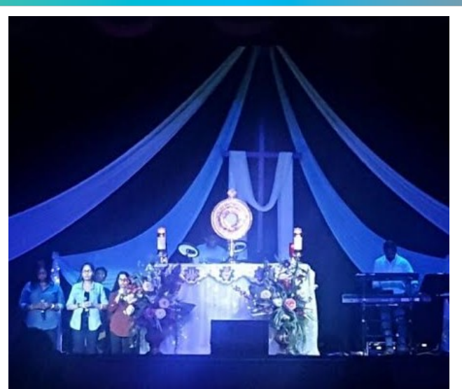
With Him: a Praise Night held at St. Joseph parish in Missouri City, TX that was centered on Eucharistic adoration and led by a youth praise team.

the youngest to the oldest. What a great implementation of this resource!