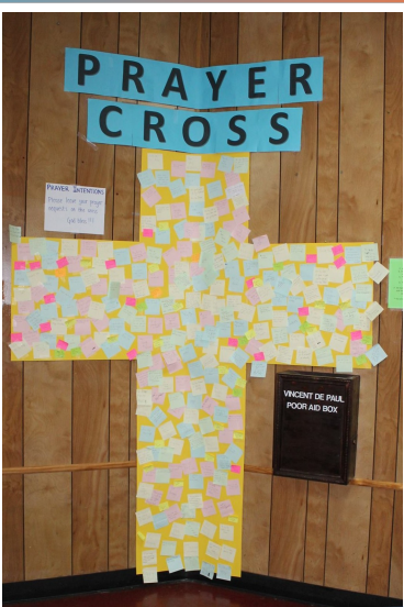
Parishioners at St. Thomas parish in Philadelphia wrote their personal intentions on this cross. The intentions were then passed out during Easter Vigil

Procession. Later, the whole parish prayed for each others' needs during the Karozutha.