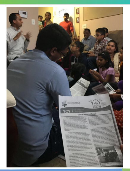
St. Mary's Ward using the April YoY Newsletter as part of ward prayer. Everyone read and discussed what it means to be a community of prayer – from

the youngest to the oldest. What a great implementation of this resource!